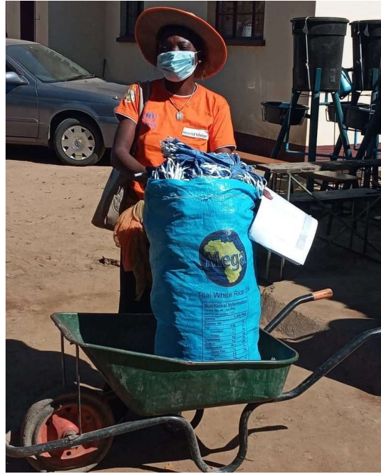
A health promoter distributes face masks in Tongogara refugee camp, Zimbabwe.

400 adolescent girls and young women received dignity kits in Malawi to enhance good hygiene and sanitation during the COVID-19 pandemic.