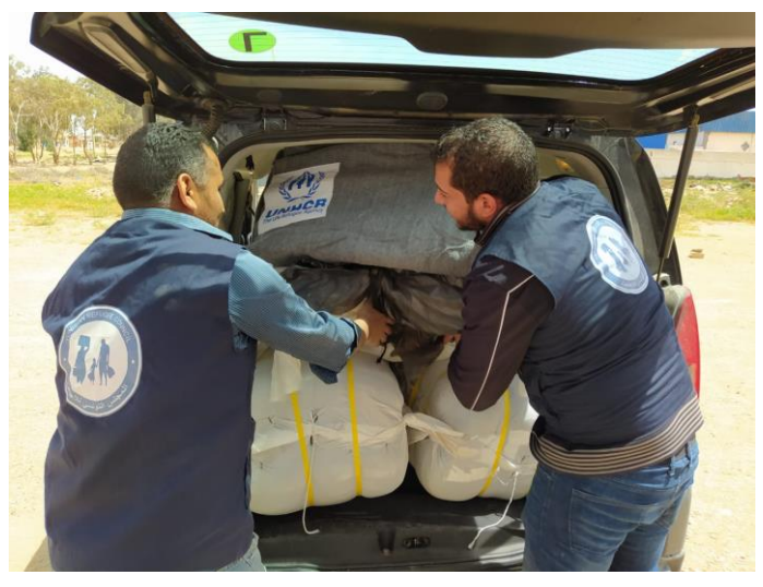
Distribution of blankets for confined patients in Djerba island

Given the high volume of calls received through helplines established by partner Tunisian Refugee Council (CTR), UNHCR provided a data collection tool (using KoBoToolbox software) to assist CTR frontline staff who receive the calls to process them more efficiently. The tool consist a digitalized 20-minutes assessment survey, currently in its pilot phase, and aims to facilitate the interaction with refugees and asylum seekers; to protection document COVID-19 related concerns; to identify persons in need of services and assistance and to collect harmonized data country-