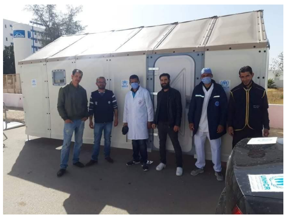
Refugee Housing Unit donated to Medenine Regional Hospital for visitors screening

UNHCR donated one Refugee Housing Unit to Medenine Regional Hospital, to be used for screening the visitors before entering the hospital. Moreover, 100 blankets were donated to Medenine Governorate for the persons under confinement coming from Djerba island.