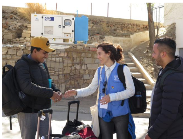
Venezuelans receiving orientation at the border in La Quiaca