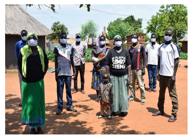
South Sudanese refugees in Adjumani's Pagirinya settlement wear masks made by fellow refugees with the support from UNHCR and partners.