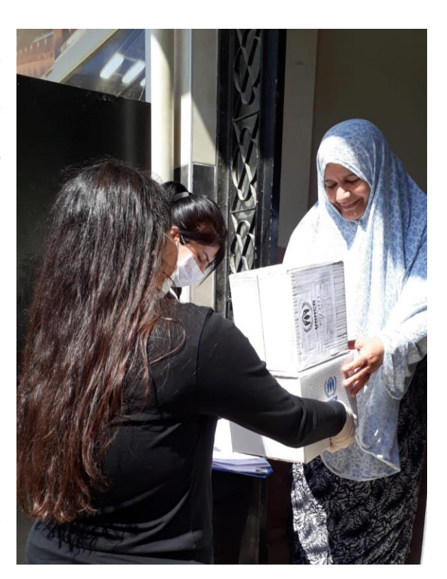
Municipalities are the first port of call for the support provided to host communities and refugees. UNHCR-supported teams distributed hygiene kits in Izmir together with Buca Municipality.

In May, the legal clinics in Şanlıurfa, Gaziantep and Hatay continued to provide legal assistance through telephone or video calls responding to matters related to international and temporary protection procedures, civil law, exit and re-entry procedures, family reunification and citizenship procedures. The Şanlıurfa Legal Clinic provided legal counselling to 70 individuals and the Hatay Legal Clinic to 41 individuals, while 23 individuals benefitted from legal assistance provided by the Gaziantep Legal Clinic. Due to the COVID-19 mitigation measures, the clinics could not carry out outreach activities. Nevertheless, teleconference meetings and webinars on case management and legal counselling organised by the legal counsellors in south east Turkey continued, attended by 160 participants.