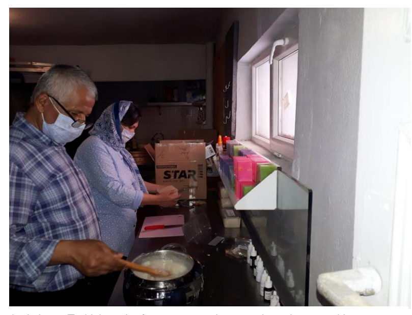
In Ankara, Turkish and refugee men and women have been working together to produce soap and face masks.

UNHCR supports the local authorities and organisations to respond to a growing need for hygiene items and personal protective equipment. Through its partners across the country, UNHCR has delivered over 12,500 hygiene kits in South East Turkey, Izmir and Istanbul. In May, 3,500 hygiene kits were delivered to the Istanbul Governorate for distribution. In Izmir, some 4,000 hygiene kits were distributed in May, while in Gaziantep and Şanlıurfa, UNHCR delivered 5,000 hygiene kits to the local authorities to support vulnerable households. In all regions, the distributions are undertaken through municipalities and partners and have benefitted both refugee and host community households.