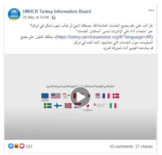
The UNHCR Turkey Information Board directs users to services available on the inter-agency platform Services Advisor. Information is posted in Arabic, Farsi and also in English.

Through its main digital communication platforms, Help and Services Advisor , UNHCR continues to share information about rights, obligations and available services with refugees and asylum seekers. By the end of May, Help had reached approximately 763,523 unique visitors since its launch in 2017. The Services Advisor platform continues to be updated with information to serve refugees better during the COVID-19 pandemic. In May, the Services Advisor Platform was visited by 4,233 new users. Help provides information to refugees across a range of themes, from registration and documentation to education and livelihoods, while Services Advisor is an inter-agency tool for refugees to search for and find details of service providers in their area. In Turkey, Help is available in four languages (English, Turkish, Arabic and Farsi). In May, the Help website got 40,135 users and 115,008 views.