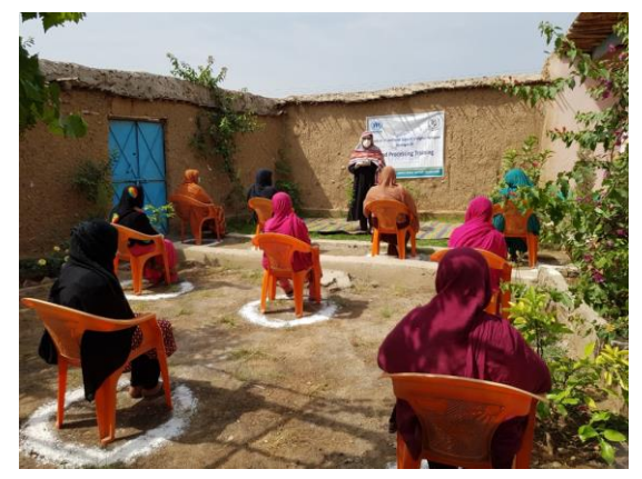
UNHCR's partner held a capacity-building training to help mitigate the socioeconomic impact of COVID-19 on refugee women.

especially street food vendors as they are more exposed to COVID-19. Outreach Volunteers are expected to use PPEs during awareness sessions to minimize the risk of contracting the virus.