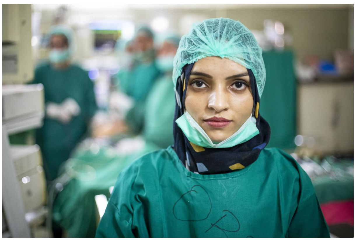
Pakistan. Afghan woman doctor breaks barriers to heal Pakistan's poor