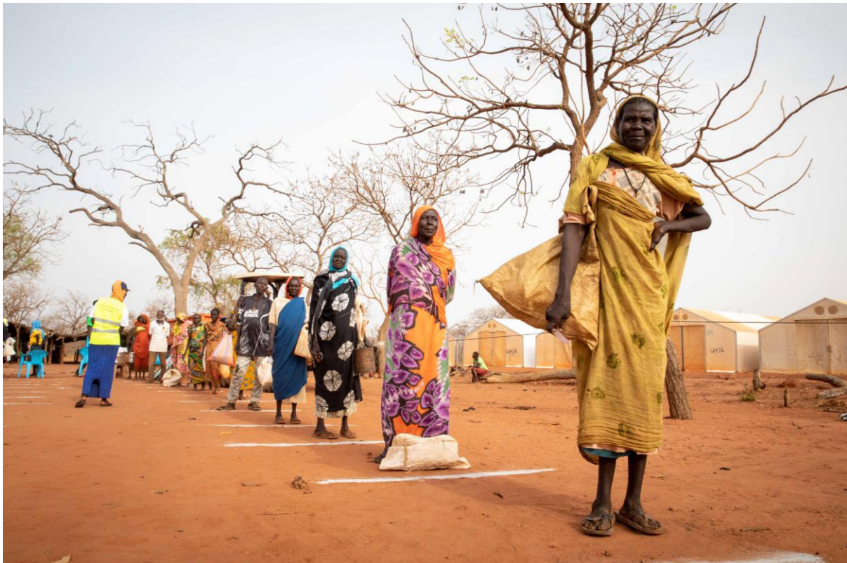
South Sudan. COVID-19 precautions during food and soap distribution