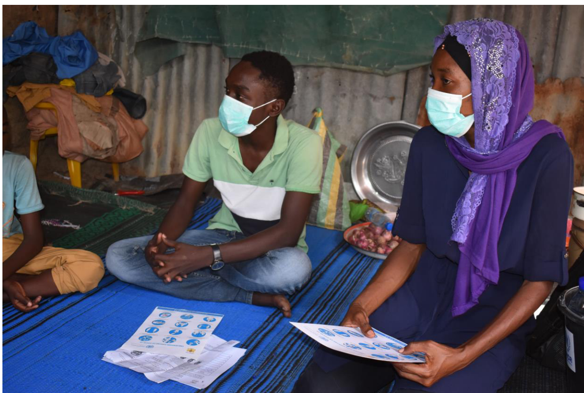
Chad: Refugee students teach COVID-19 awareness in city communities