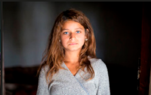
Lirije, 13 The former Yugoslav Republuc of Macedonia