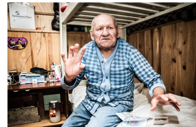
Elderly under a risk of eviction, Bovary Collective Center.

“I have a 19 year old disabled child. We were allocated a room with two iron beds. I went to Kuyalnik to find a room, because he shouldn't be breathing in dust. We were rejected everywhere (...). We can neither make plans for the future nor look back on the life that used to define our daily existence. Our life no longer has any solid foundation.”