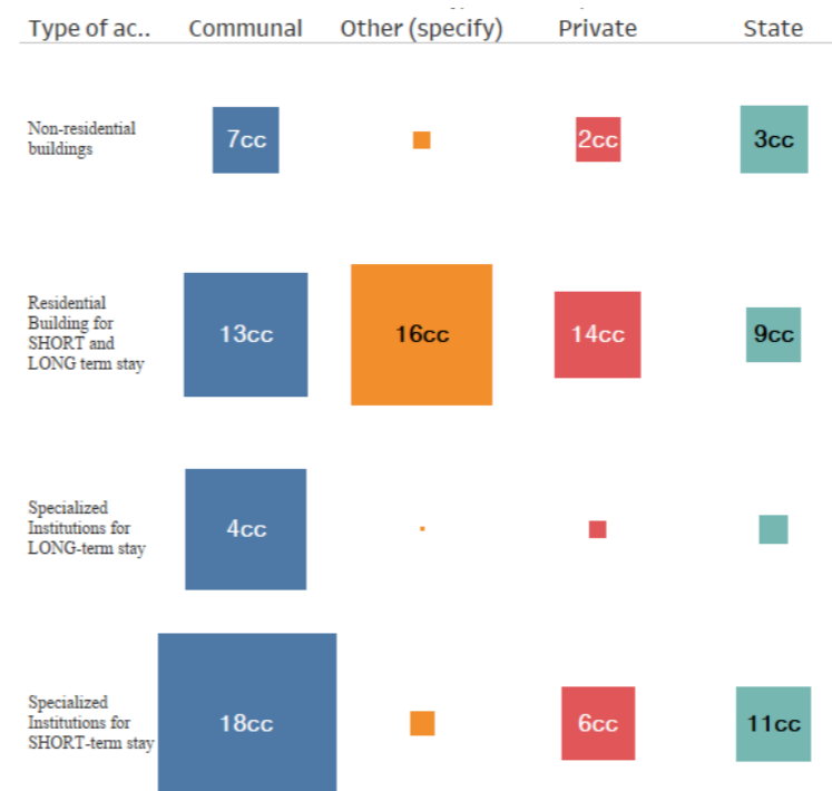
Diagram breakdown per type of ownership and category of building: Size of the square, the number of IDPs. Label, the number of Collective Center.

Type of Ownership: When analyzing the type of ownership of Collective Centers, a large majority of vulnerability categories are residing in communally owned properties (59% of IDPs) showing the role that local administrations play in providing accommodation to the most vulnerable IDPs. Privately owned collective centers account for 11% of the IDP population, and state owned collective centers account for 12% of the IDP population. 18% of IDPs are living in civil society operated and religiously owned centers .