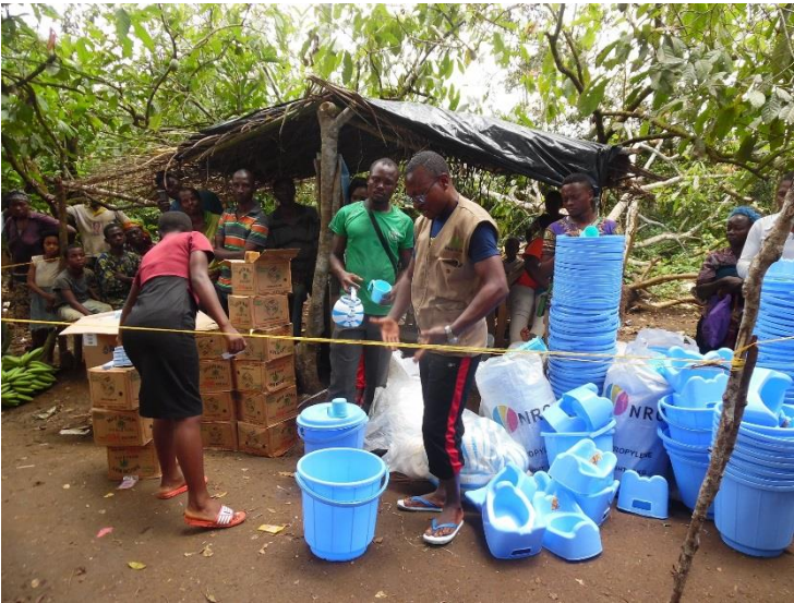
NFI distribution SW Cameroon. REACH OUT, 2018.