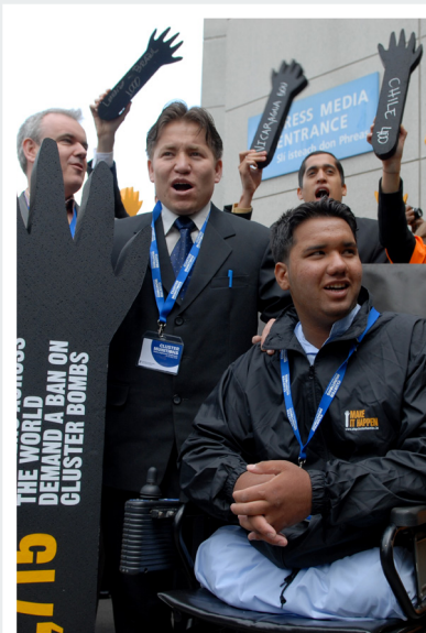
Ban advocates and campaigners at a Conference on Cluster Munitions, Dublin, 2008

“Ban advocates” (BA) is an advocacy group of cluster munitions victims from 12 countries. It started in 2007 with the support of HI.