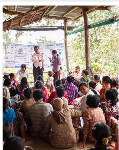
Happy Child project for mother and child, Siem Reap, Cambodia

Identified problems: Victims & PwD face important barriers to participate on an equal basis with other people in social & work life. | Main objectives: 1. To support the authorities in achieving their VA obligations as per the MBT & the Cartagena Action Plan. 2. To identify victims in the two most affected regions, and improve their access to social & livelihood services . | Activities: A) Policy: Enhance VA coordination by organizing multi-stakeholders workshops with the Ministry of Gender, Labor & Social Development. B) Personalized support: Provide individual support to enable victims to define needs & priorities and develop a plan to reach their goals. C) Access to services: Map health, psychosocial and livelihood services and support them to become accessible (awareness raising & training). Within social activities, a focus was given to sport & leisure activities, which was a priority for self-help groups. D) Empowerment: Support self-help groups to start & improve their capacities and activities related to sport & leisure (easy adaptations to sport & leisure rules and equipment to make them accessible).