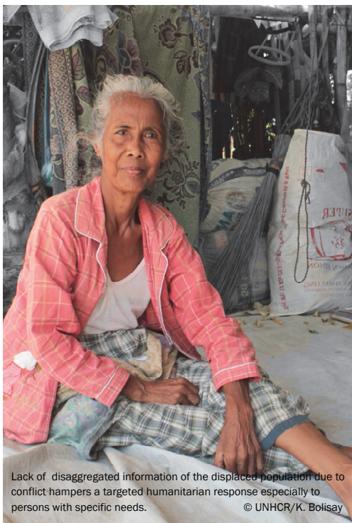
Lack of disaggregated information of the displaced population due to conflict hampers a targeted humanitarian response especially to persons with specific needs.

triggered by a land dispute, has left one civilian dead and one wounded. The families remain displaced as of this report.