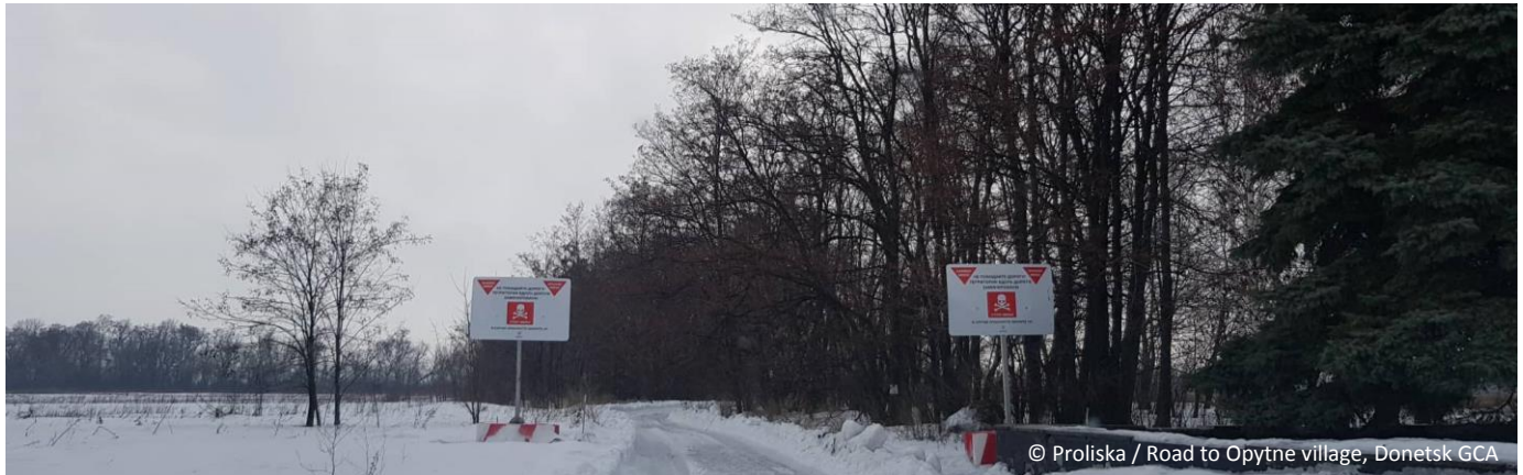
Road to Opytne village, Donetsk GCA

THE PROTECTION CLUSTER INCLUDES SUB-CLUSTERS ON CHILD PROTECTION, GENDER BASED VIOLENCE AND MINE ACTION