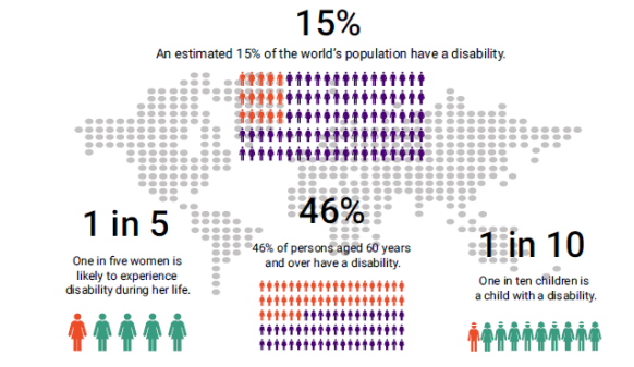
Figure 1 Global population of persons with disabilities (IASC Guidelines, 2019, Inclusion of Persons with Disabilities in Humanitarian Action)