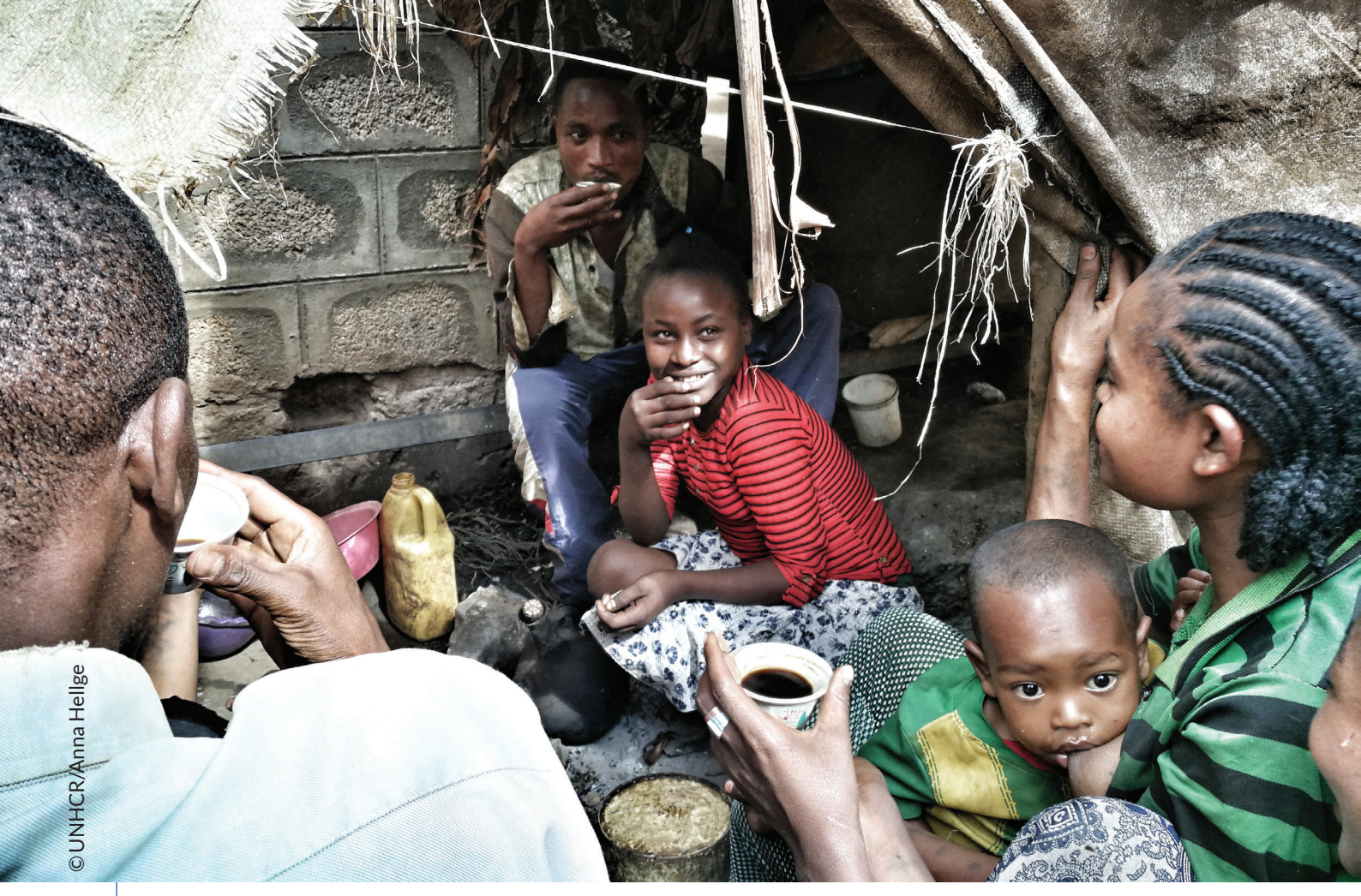
Ethiopia. UNHCR responds to huge displacement with lifesaving aid