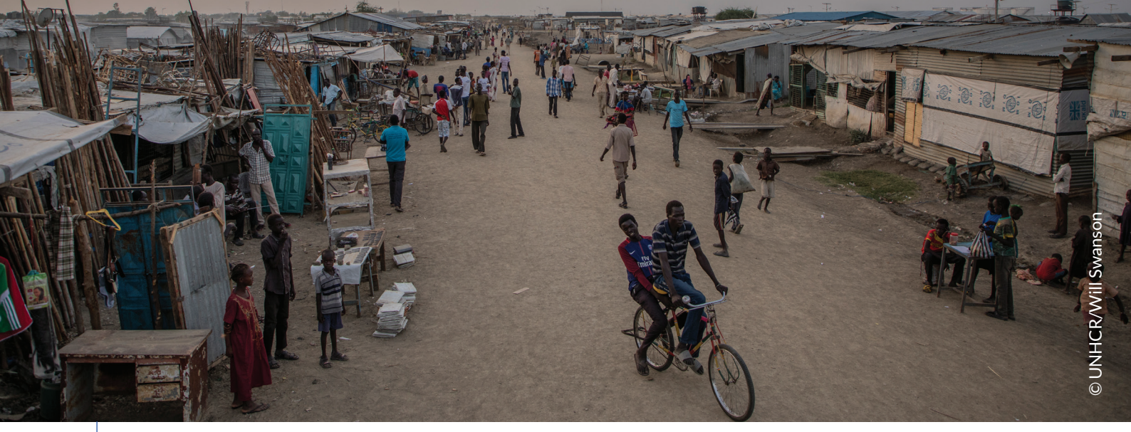
Internally displaced South Sudanese walk through the streets of the Protection of Civilians site near Malakal, Upper Nile.