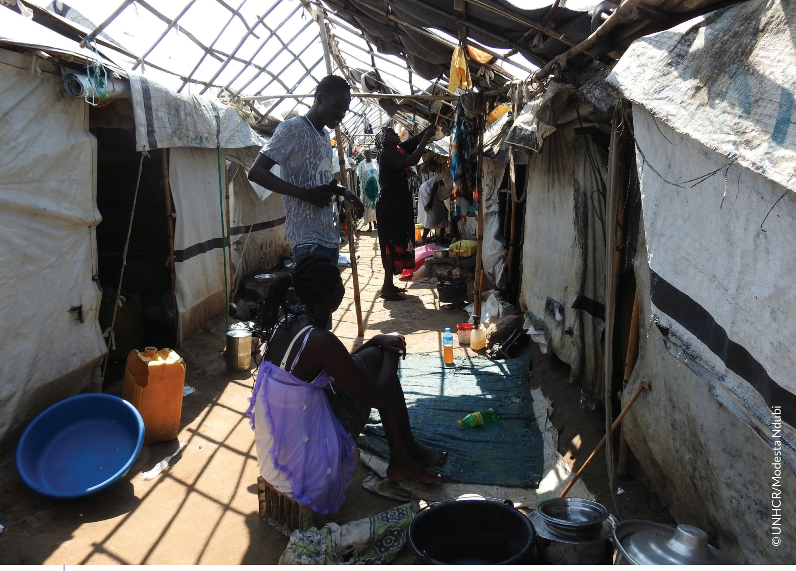
Makeshift shelters in Mahad camp. The majority of people here are women and children from Jongeli, displaced inside South Sudan by the conflict.