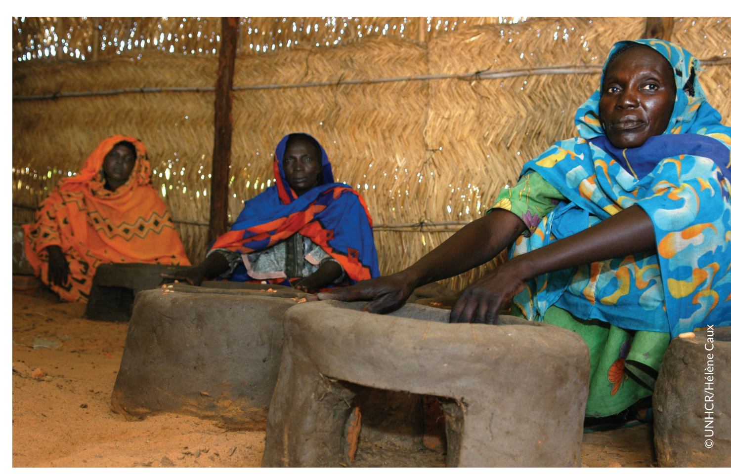
Displaced women make fuel efficient stoves at the UNHCR centre for women in Rylad camp in Sudan's Darfur region in 2005.

Abdirahman Ahmed Great Lakes Secretariat National Human Rights Institutions