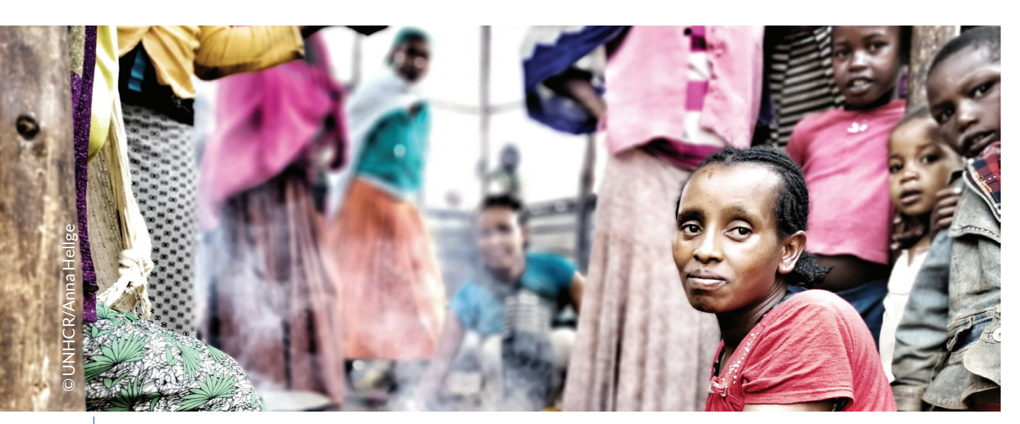
A woman of the Gedeo community uses the basic cooking facilities at a hospital site for displaced people in Dila, Gedeo, SNNP region of Ethiopia.

Support capacity strengthening of IGAD Member States on IDP data collection, analysis and use through the dissemination of the Expert Group on Refugee and IDP Statistics recommendations on IDP data in 2020