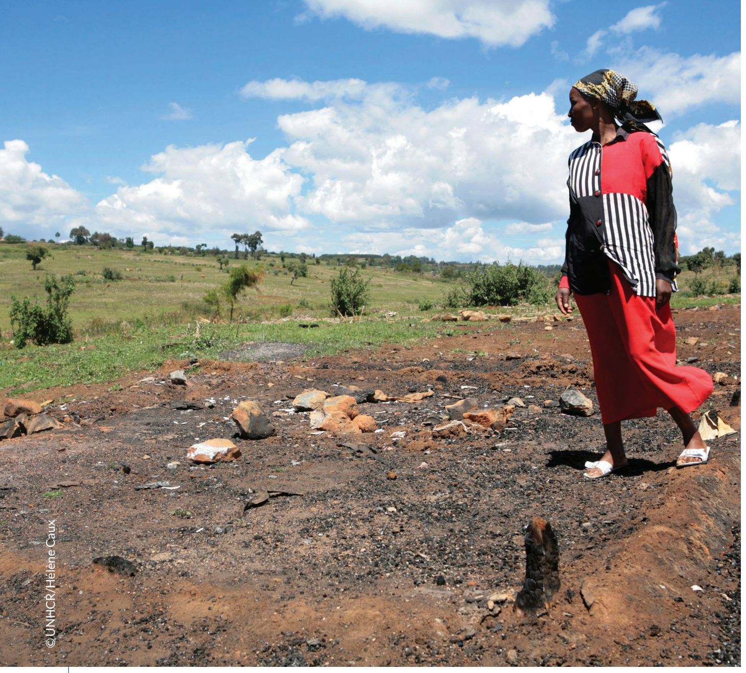
An IDP woman, part of the UNHCR go and see visit, walks in the remains of her burnt house in Kenya.