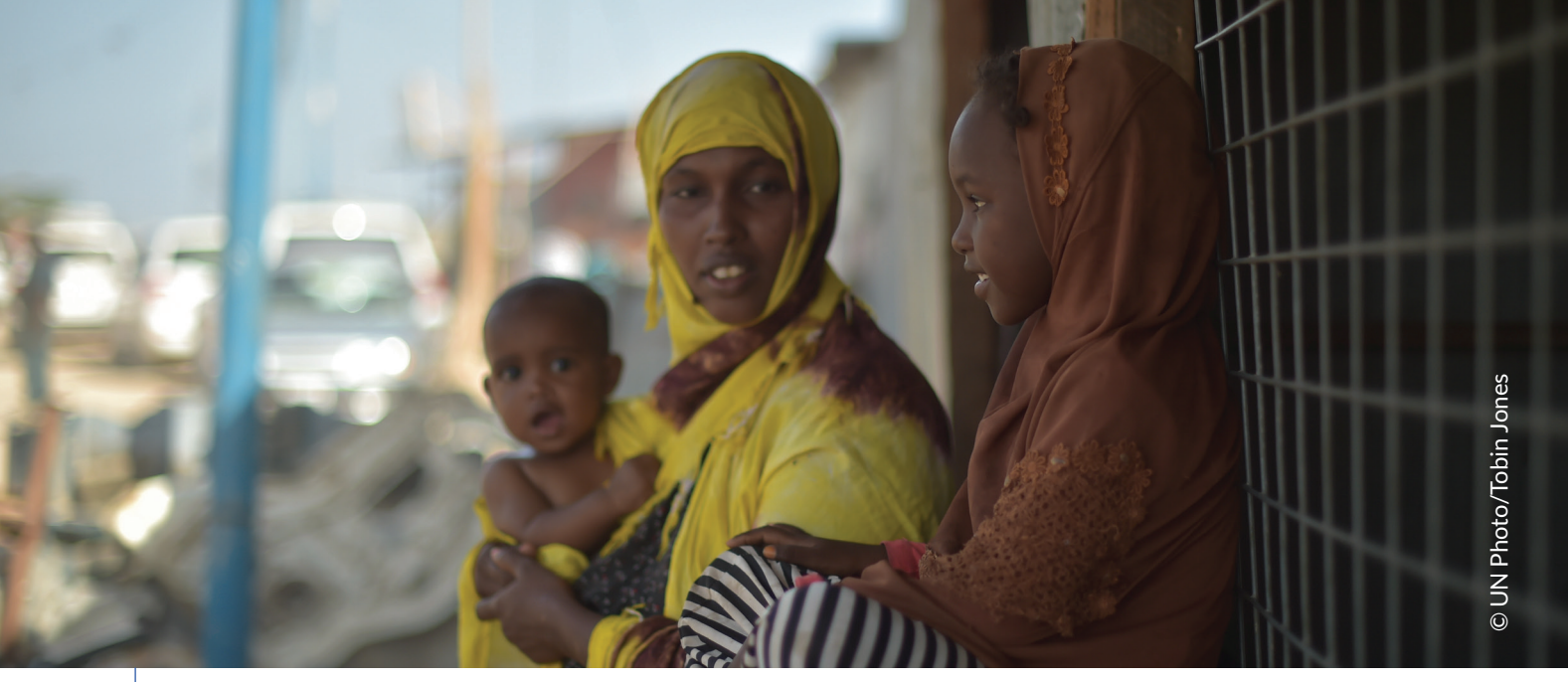
A mother speaks with her daughter while standing in the shade at Dakinle IDP camp in the outskirts of Mogadishu, Somalia.

A strong message in the HDP nexus discussions was on the importance of cash assistance. Cashbased programming from the outset helps prevent a culture of dependency, which is counterproductive to achieving durable solutions. It empowers people to make choices for themselves and stimulates community action. The private sector also has a role here with microfinance, as IDPs have had access to through banks in Sudan. The private sector could also work more closely with development actors to prevent and mitigate disasters and improve access to energy sources for displacement-affected communities.