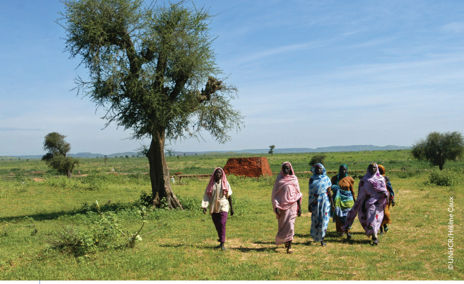
Displaced women in Sudan's Darfur region worked in a brick factory to help support their families in 2005. Hélène Caux