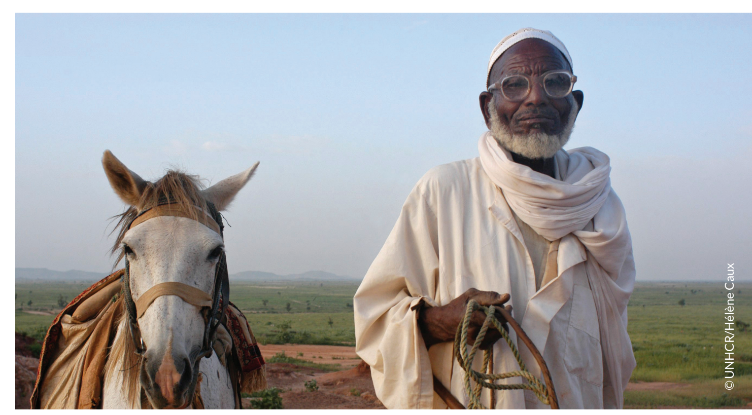
An internally displaced Sudanese civilian brings his horse back from grazing at the Riyad camp in Sudan's Darfur region in 2004

Various indicators of IDP resilience were shared at this event: diversification of family income streams, elevation of employee status (eg. from beggar to written contract), improvement of housing tenure, increased food security, evolution of assets and access to services over time, hosting of IDPs rather than being displaced, and perceived ability to cope with stresses and shocks. Separate resilience monitoring is not always required, as existing mechanisms such as the Humanitarian Needs Assessements could be better used for this purpose. The UN Food and Agriculture Organization in Uganda uses the Resilience Measurement Index Assessment where data of the displaced and host communities on their assets and access to services is reviewed 18 months later. South Sudan, Sudan and Somalia are planning to also adopt this tool.