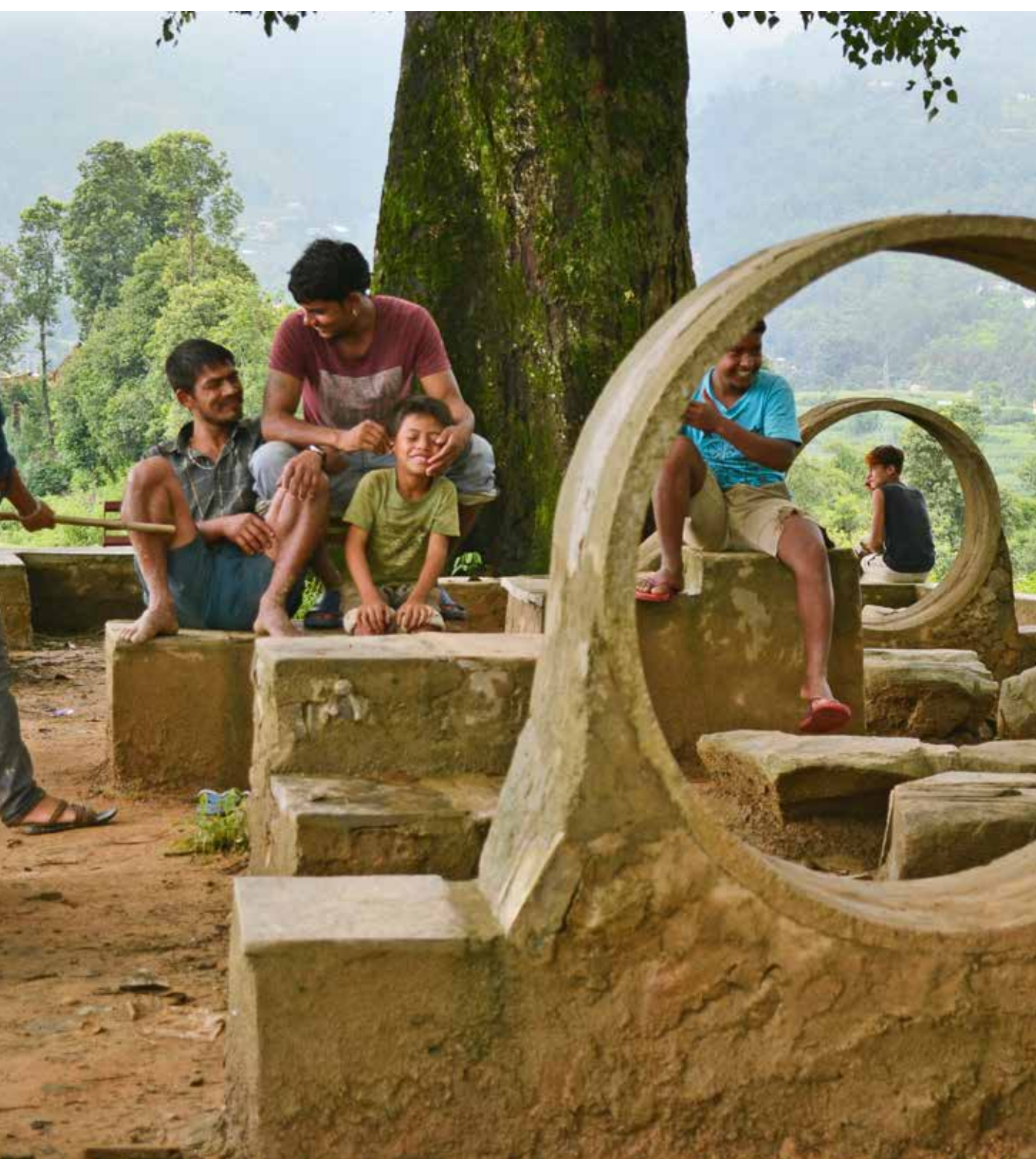
Community spaces help. © Aakash Vishwakarma / SEEDS, Dhading, Nepal.