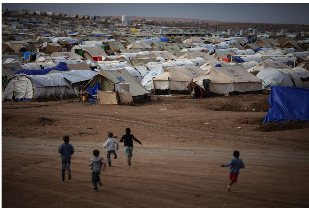
Domiz refugee camp near Dohuk in the Kurdistan Region of Iraq is critically crowded. Construction of the new Darashakran camp in Erbil for Syrian refugees is underway.