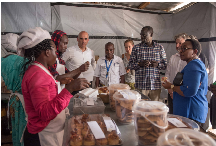
Photo: President of Swiss Confederation, H.E. Alain Berset, enjoys a Swiss roll made by refugees when he visited a refugee owned bakery at Kalobeyei settlement