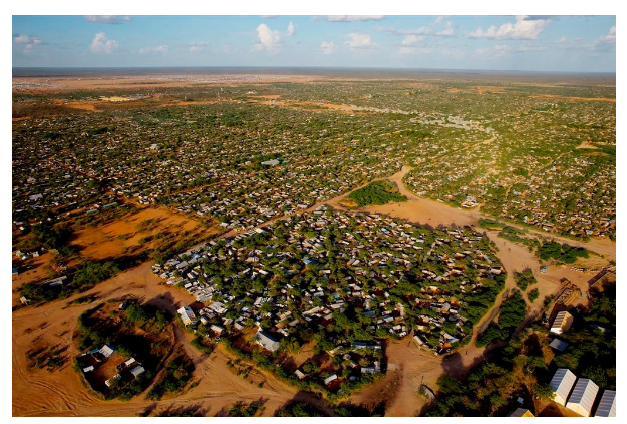
Ifo from the air