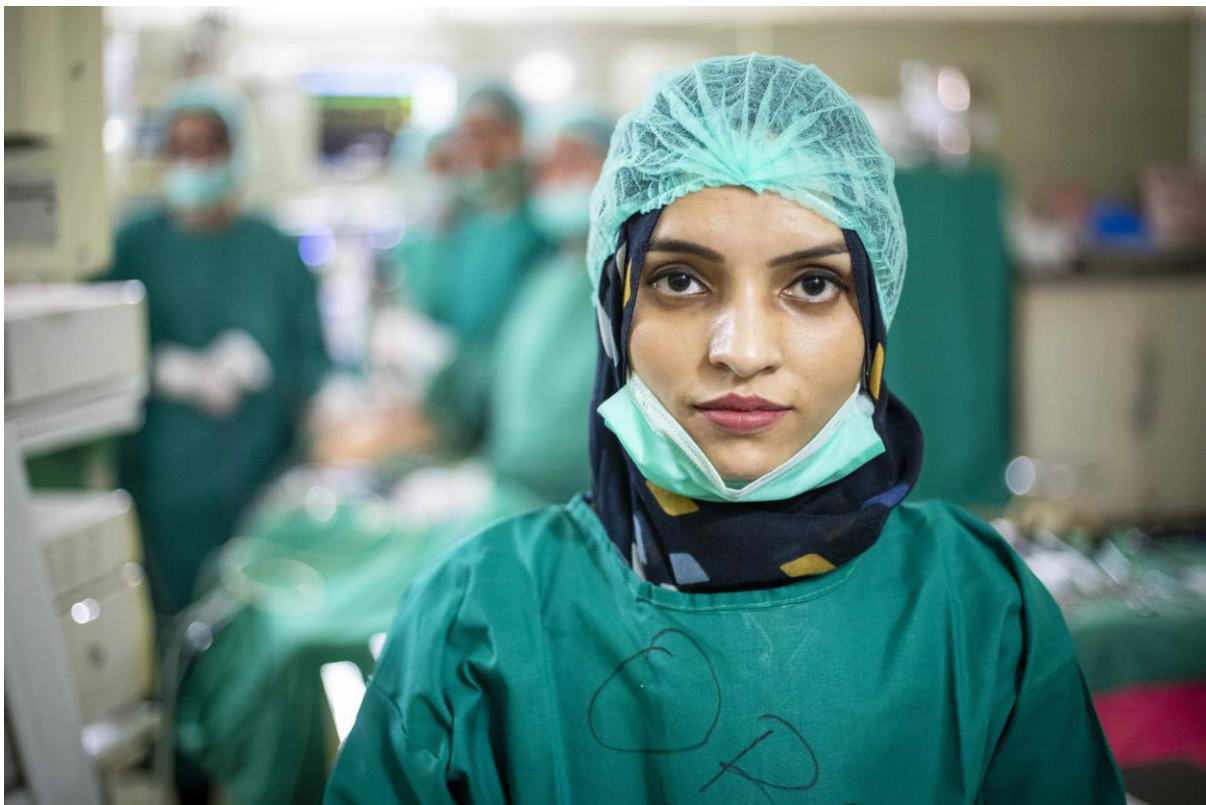
Pakistan. Afghan woman doctor breaks barriers to heal Pakistan's poor