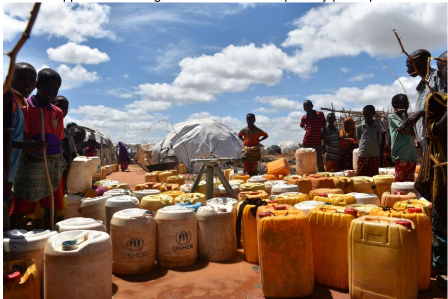
Refugees collect water from one the water distribution points in Dagahaley camp of Dadaab.