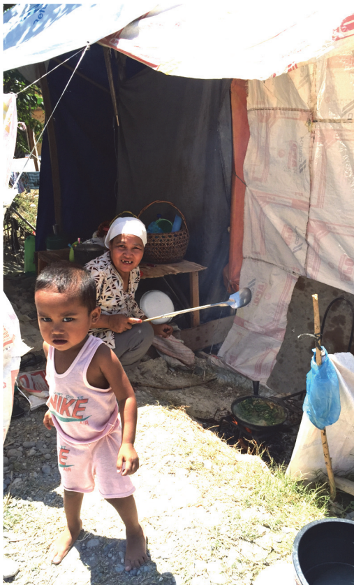
Lack of disaggregated information of the displaced population due to conflict hampers a targeted humanitarian response especially to persons with specific needs.

and Response Team (HEART) dated 29 March, the number of displaced may be as high as 8,755 persons. The majority of the displaced families are staying with their relatives while others are being sheltered in identified evacuation centres such as health centres, Islamic schools and municipal halls.