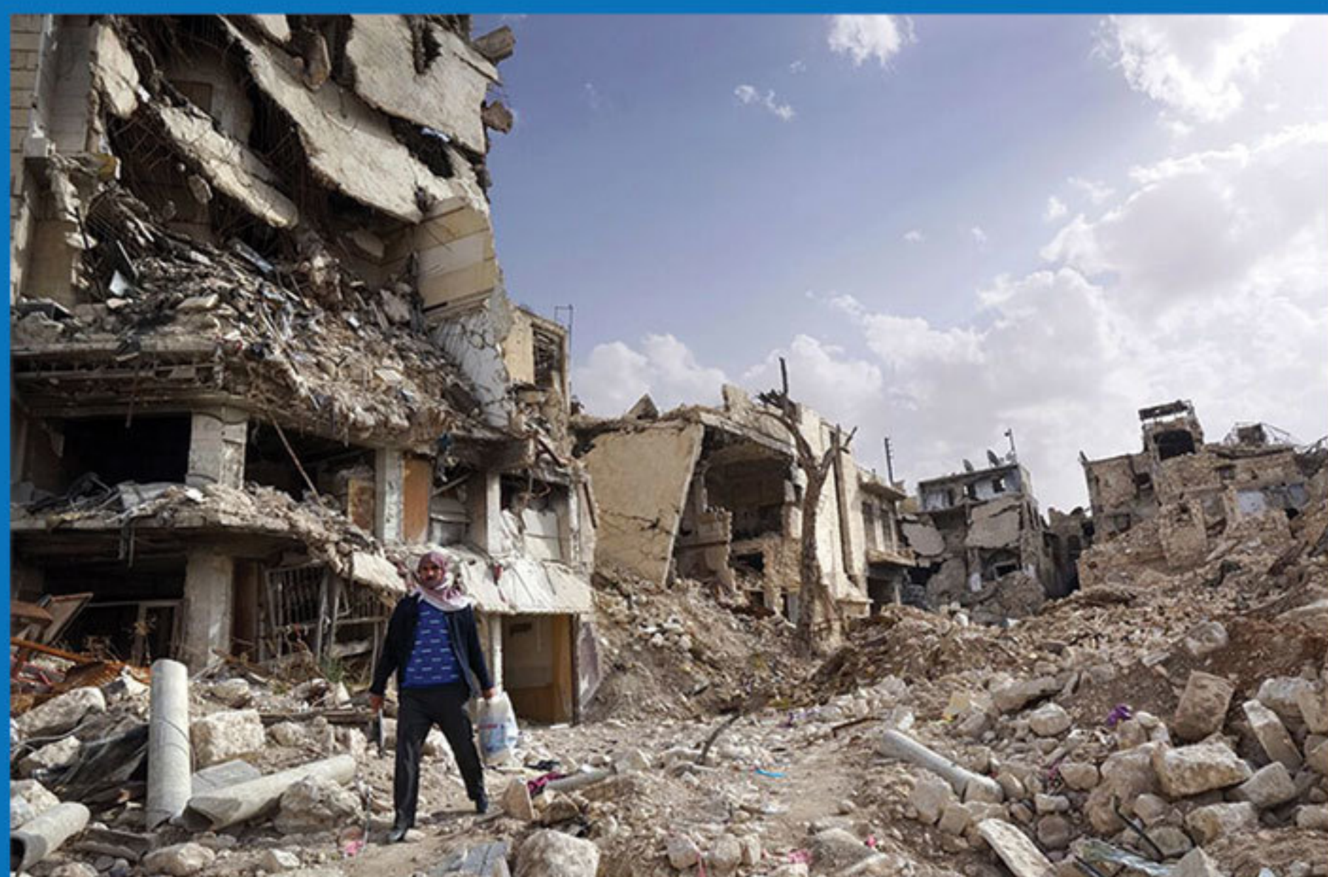
Syria. In the shadow of destruction, life resumes in Aleppo. A returnee makes his way through piles of bricks in a heavily damaged part of Aleppo’s Old City.

In December last year, UN agencies and some 270 NGO partners appealed for USD 4.4 billion from the global community to support both refugees and the communities hosting them. But the gap between the needs and available resources remains wide. In 2017, the international response received only half of required funding.