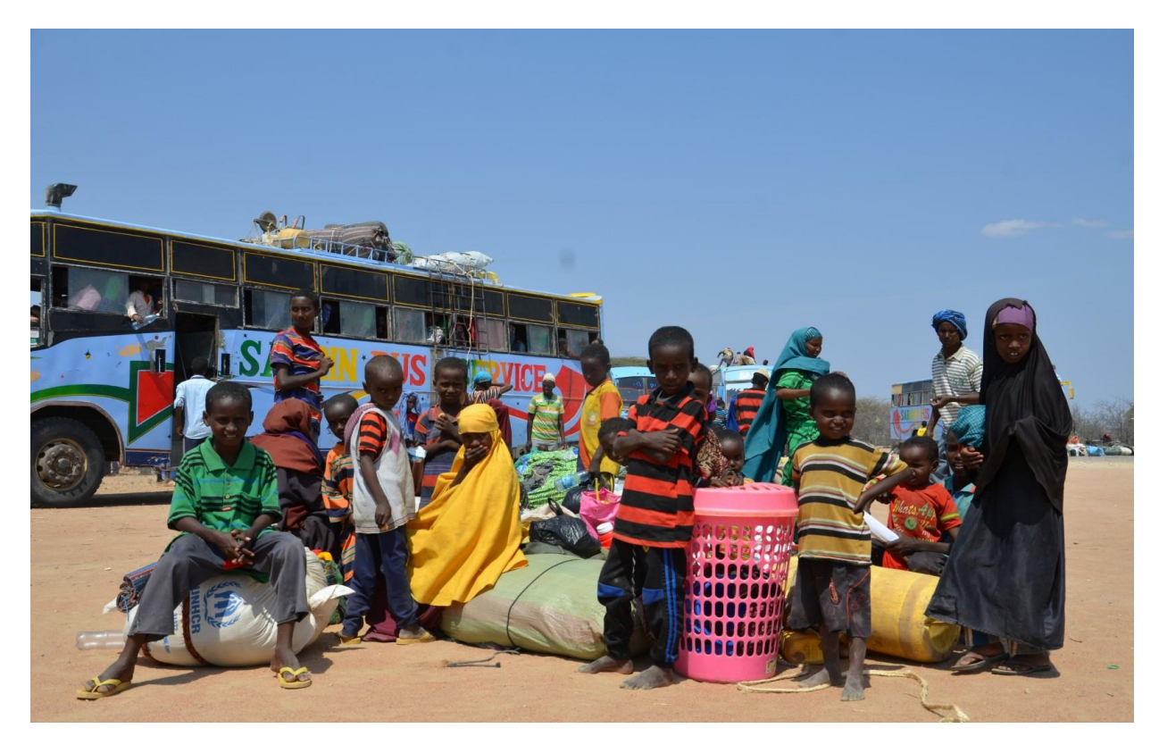
Refugees returning to Somalia under UNHCR's voluntary repatriation Program.