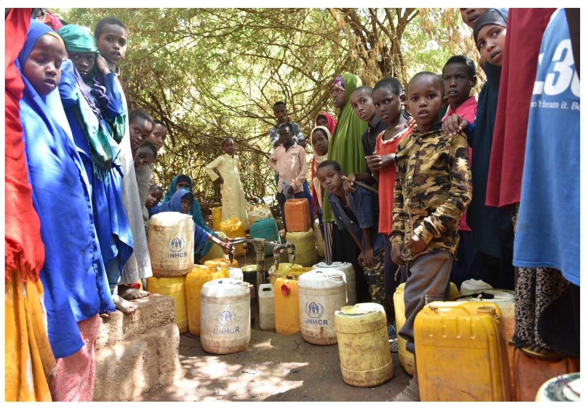
Refugees collect water from one of the water distribution points in Ifo camp of Dadaab.