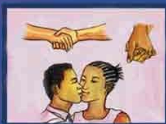
By kissing, hugging or touching