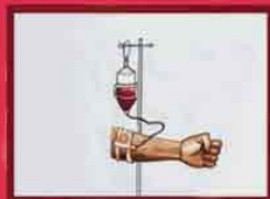
Blood transfusion using blood infected with HIV