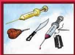
Unsterilised syringes, needles or knives