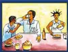
Sharing plates, glasses, spoons or eating together