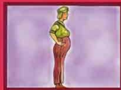
A woman or girl who is infected with HIV can transmit the virus to her baby during pregnancy, delivery or during breastfeeding