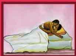
Unprotected sex (without a condom)