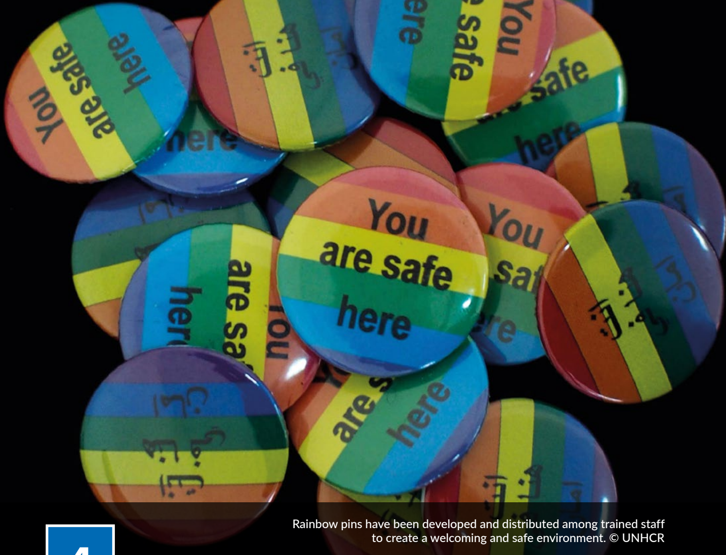
Rainbow pins have been developed and distributed among trained staff to create a welcoming and safe environment.