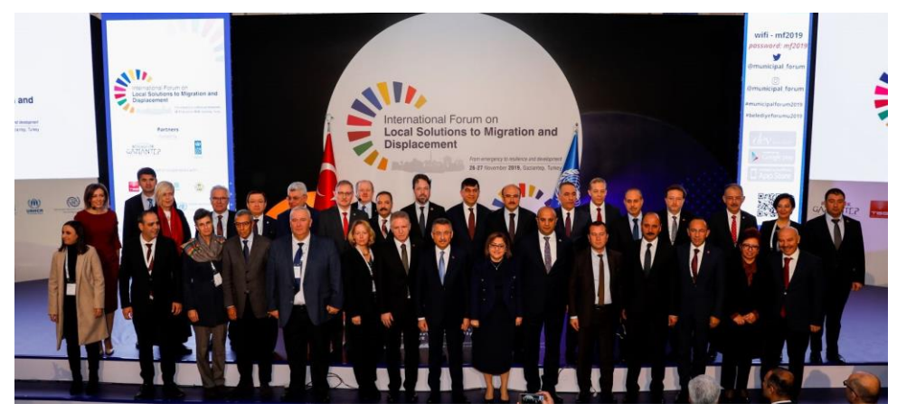
Notable officials, mayors and development actors gather at the International Municipal Forum in Gaziantep.

The International Forum on Local Solutions to Migration and Displacement (the Municipal Forum) 'From Emergency to Resilience and Development', took place on 26-27 November in Gaziantep and was coorganized by the Gaziantep Metropolitan Municipality, UNDP, UNHCR, IOM, the World Academy For Local Government and Democracy (WALD), the Union of Municipalities of Turkey, and the United Cities and Local Governments Middle East and West Asia Section (UCLG-MEWA). The Forum brought together mayors and local development actors from various countries to share good practices and facilitate city-level partnerships. The Municipal Forum contributed to existing networks of relevant actors in migration and forced displacement contexts. It also highlighted approaches in light of the Global Compact on Refugees (GCR) and the Global Compact on Safe, Orderly and Regular Migration (GCM). A key outcome of the Municipal Forum was the Gaziantep Declaration reflecting good practices on local solutions to migration and forced displacement. The Gaziantep Declaration was signed by 37 stakeholders including mayors and representatives of local development actors, civil society and UN agencies.