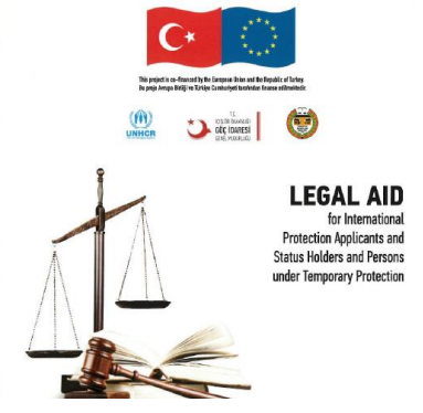
Cover of Legal Aid leaflets produced through UNHCR's cooperation with DGMM

A workshop on Country of Origin Information (COI) and its latest developments took place in Ankara on 26 November with the participation of 16 DGMM/PDMM personnel. UNHCR and DGMM discussed the COI Method Guide jointly drafted by a technical team from DGMM and UNHCR and shared findings of COI-related study visits to Germany and Belgium. Discussions also covered principles and standards when using COI, as well as current practices and opportunities for further improvement.