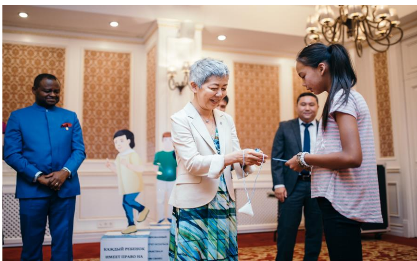
BISHKEK, Kyrgyzstan. Passport Handover Ceremony to Former Stateless Persons.

National Office in Bishkek, the Kyrgyz Republic