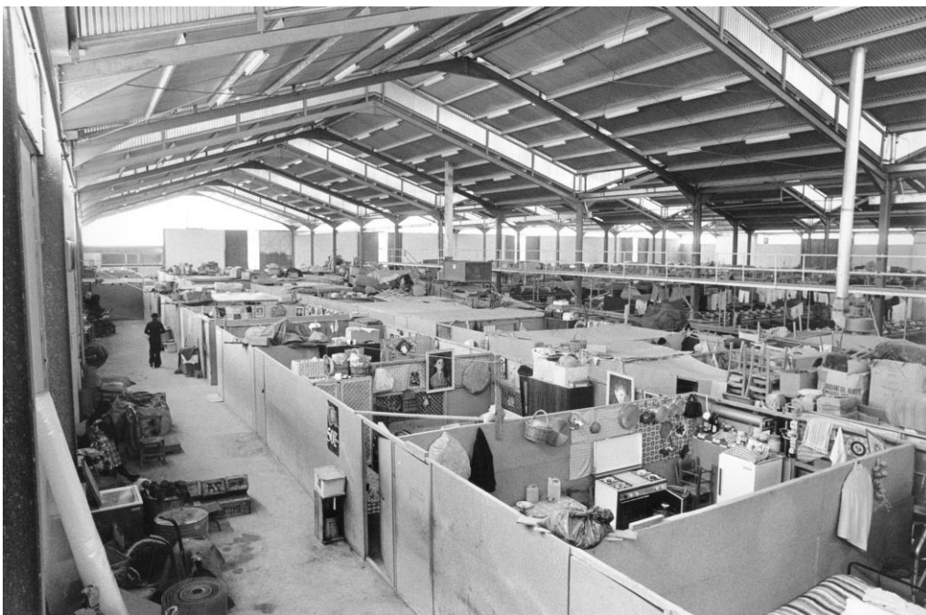
In 1974, some 400,000 people were internally displaced in Cyprus. UNHCR arrived on the island and coordinated humanitarian aid, including food, health and shelter provision.

UNHCR has been present in Cyprus since 1974 when it arrived on the island to provide humanitarian aid for the displaced populations in both communities. By 1998, the need for relief assistance for internally displaced Cypriots had declined, and UNHCR handed over the work to other UN development agencies. With the increase of refugee arrivals in 1998, and in the absence of national asylum legislation and infrastructure, UNHCR had to assume the responsibilities for registering asylum-seekers arriving on the island and processing their applications. In 2000, the Republic of Cyprus adopted its first national refugee legislation and asylum procedures, and in 2002 it took over from UNHCR the responsibility for asylum adjudication.