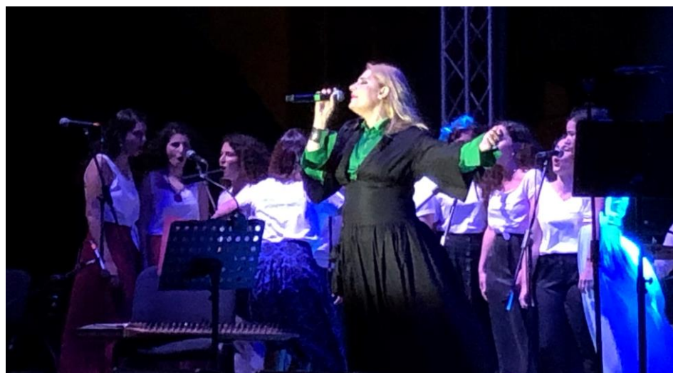
Internationally acclaimed Cypriot artist Alexia, performed together with refugee and local children and artists in Nicosia to mark World Refugee Day 2019.