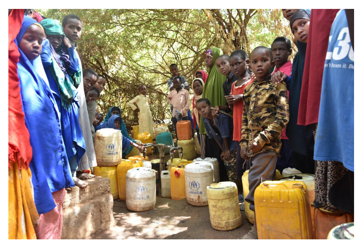
Refugees collect water from one the water distribution points in Ifo camp of Dadaab.