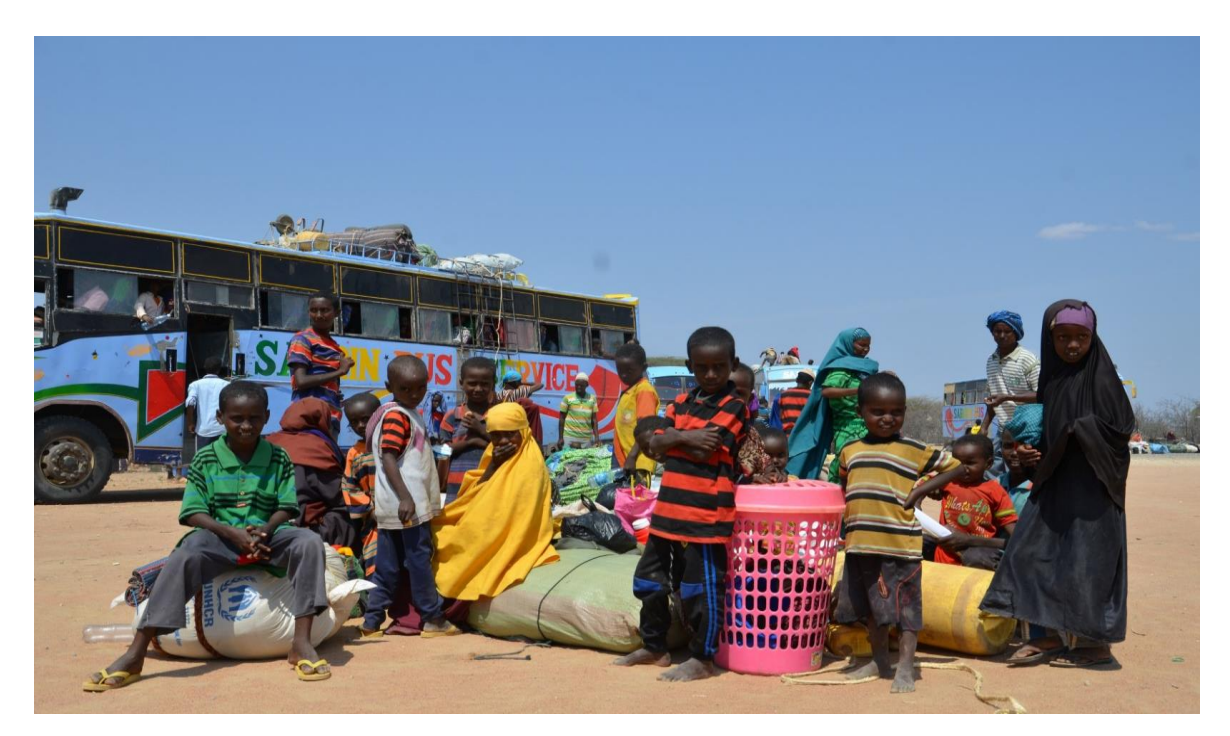
Refugees returning to Somalia under UNHCR's voluntary repatriation Program.