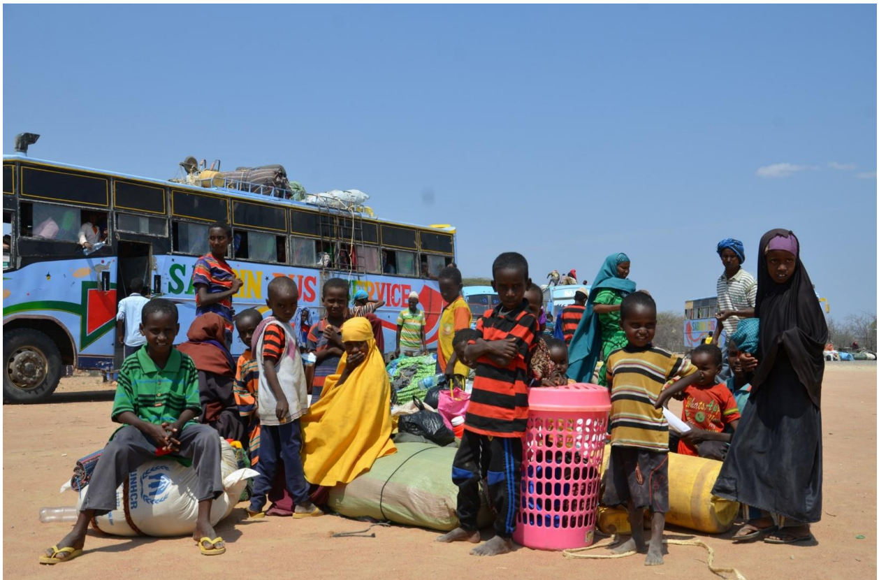
Refugees returning to Somalia under UNHCR's voluntary repatriation Program.