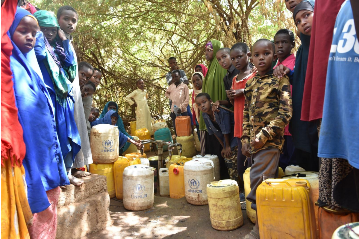
Refugees collect water from one the water distribution points in Ifo camp of Dadaab.