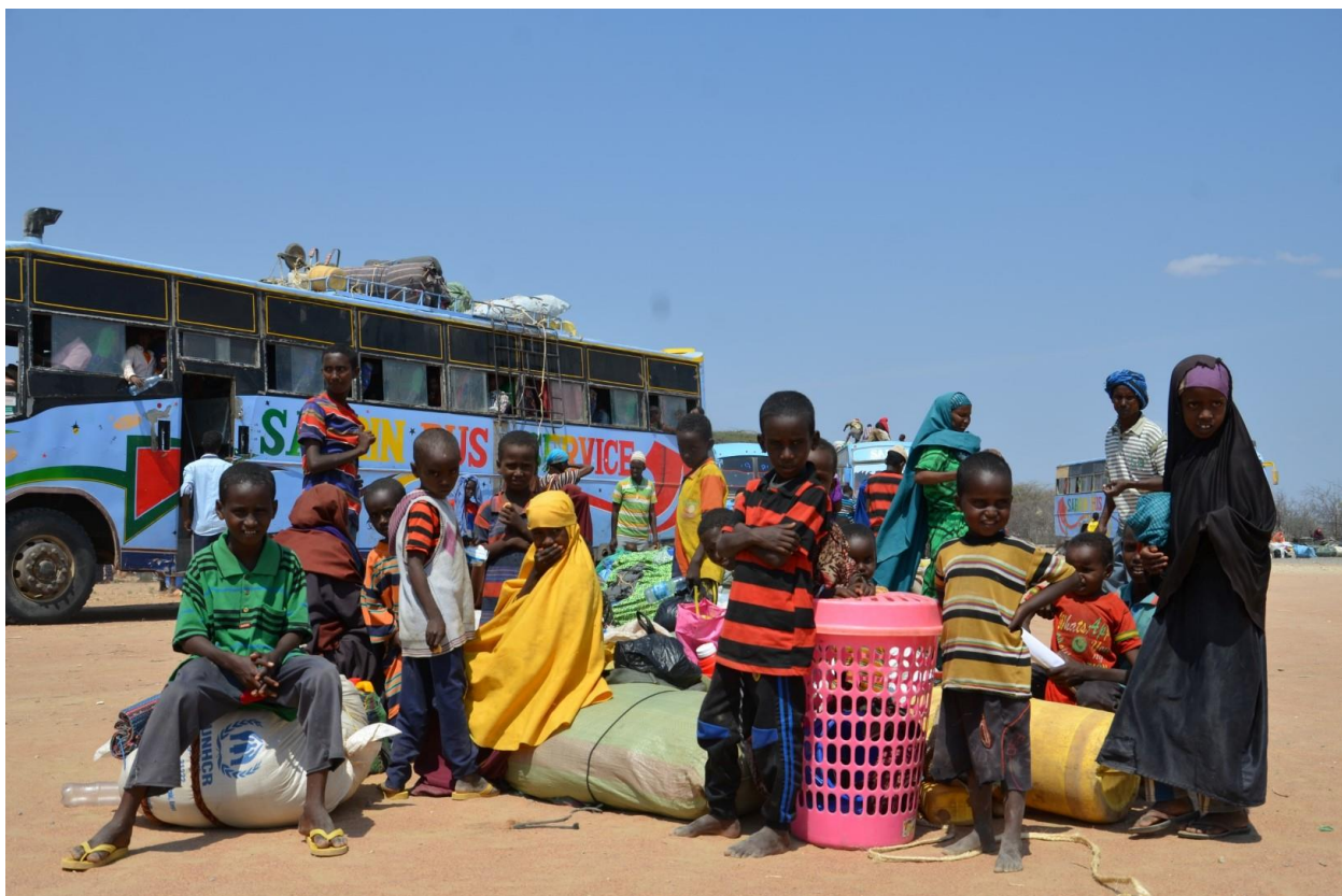
Refugee returning to Somalia under UNHCR voluntary repatriation Program.