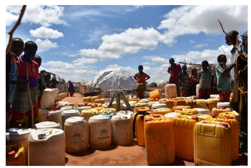
Refugees collect water from one the water distribution points in Dagahaley camp of Dadaab.

During the reporting period, UNHCR supplied on average 33.7 liters of water per day per capita from 27 boreholes to the entire refugee population in the three Dadaab camps. 26 of these boreholes operate on Solar PV- Diesel hybrid system. The water supply schemes convey water to 45 tanks with a total storage capacity of 4,550 m3, distributed through а pipeline network of 233.2 km and relayed to 659 tap stands with about 2,714 taps, scattered around the three camps.