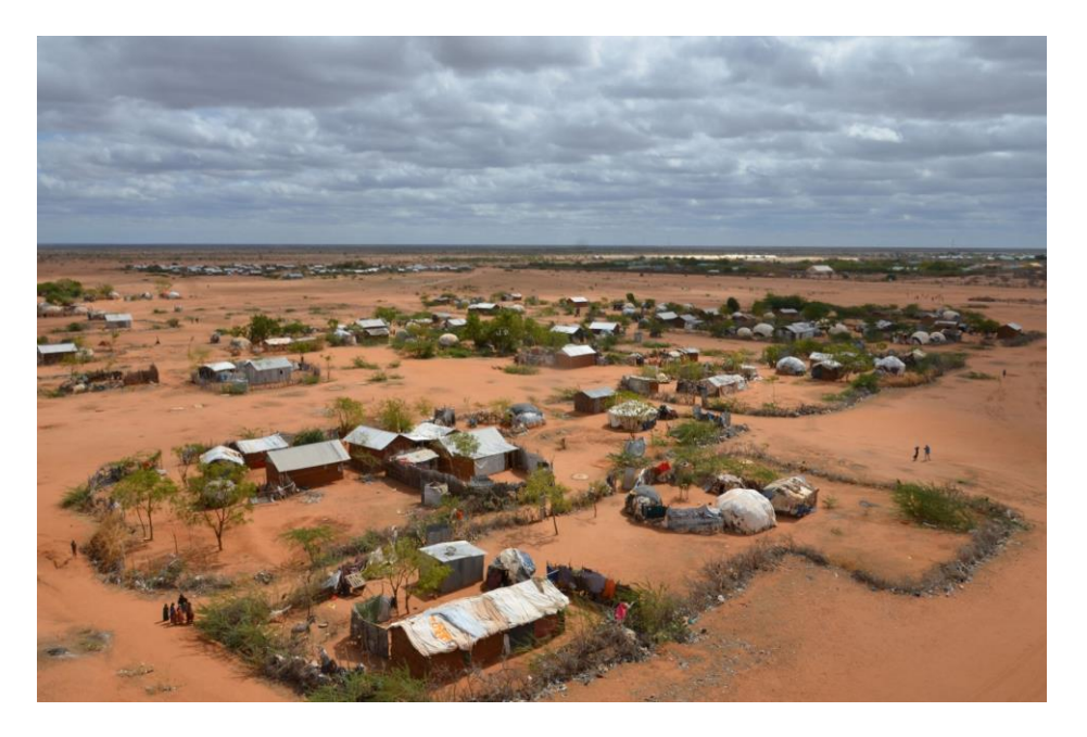
Ifo 2 camp of Dadaab closed on 31st May 2018.