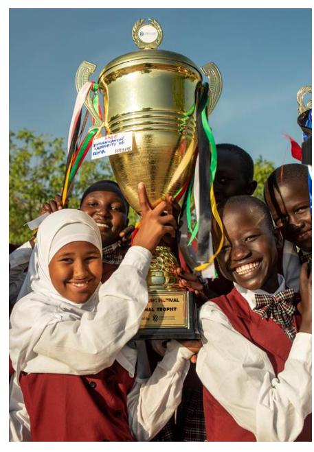
Angelina Jolie schoolgirls pose for a photo with one of the 10 trophies won at the Kenya National Music Festival.