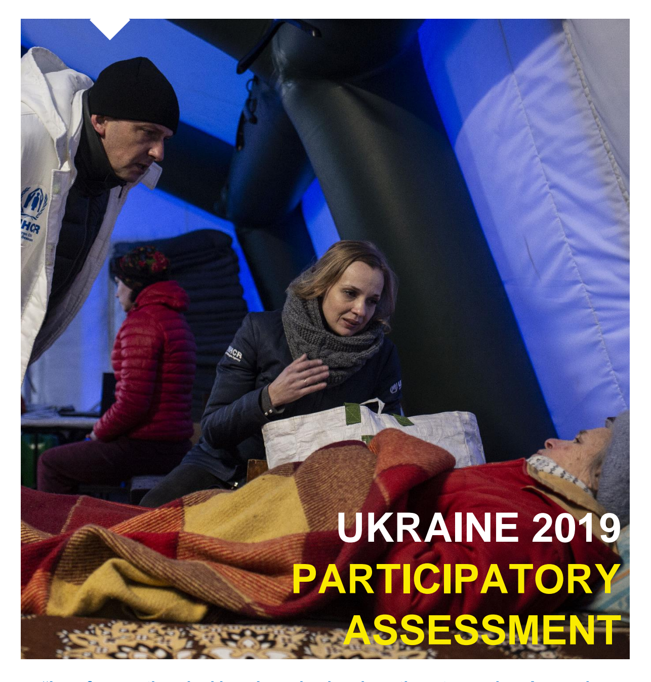
"I am frequently asked how I survived and continue to survive. Answering these questions makes me stronger."

The 2019 Participatory Assessment Report of refugees, asylum seekers, and internally displaced persons in Ukraine