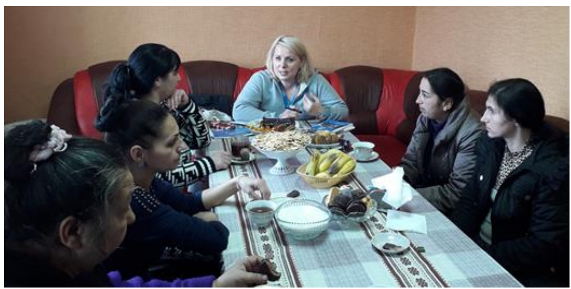
UNHCR meets with IDP Roma women during focus group discussion in Zolotonosha Town in Cherkasy Oblast in Central Ukraine. The discussions took place in a Roma Community center run by the Roma NGO Ame-Roma with which UNHCR is frequently cooperating. UNHCR supported the community center in 2017. One of the main challenges mentioned by the women was the safety of their children and their difficult socio-economic situation.

Undocumented Roma displaced by the conflict are in a legal limbo and must frequently change their residence. They say they face discrimination from the SMS and the local community. Since most are illiterate, they engage mainly in seasonal work on farms. Their children have no access to kindergartens/schools, and the women have no access to social payments or health care.