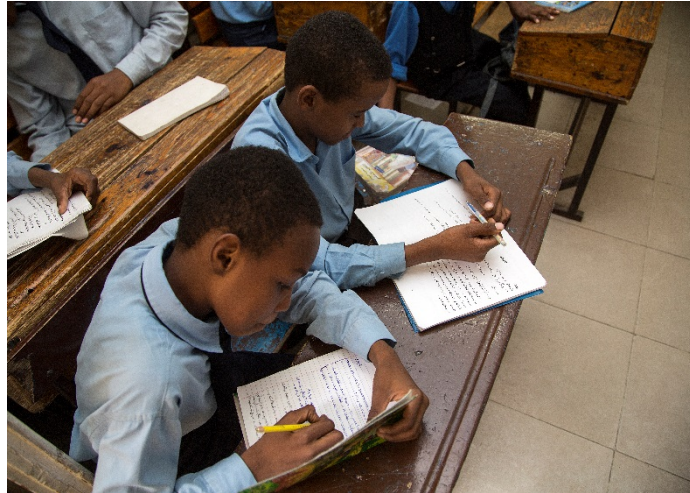
Refugee boys during a class in a community school in Cairo