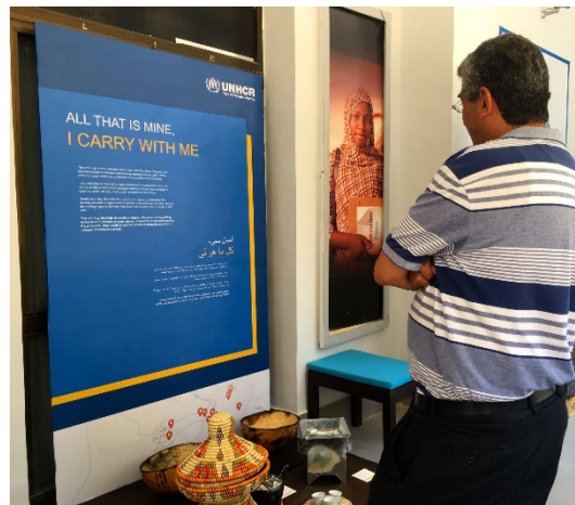
UNHCR staff member checking out the refugee products

UNHCR Egypt Representative Mr. Karim Atassi inaugurated an exhibition of products by refugee artisans at UNHCR Egypt's premises titled "All that is mine, I carry with me". The pieces on display were made by refugees and asylum-seekers of different nationalities residing across Cairo. The exhibition is designed to be a touring exhibition with a first stop in Old Cairo at Darb 1718.