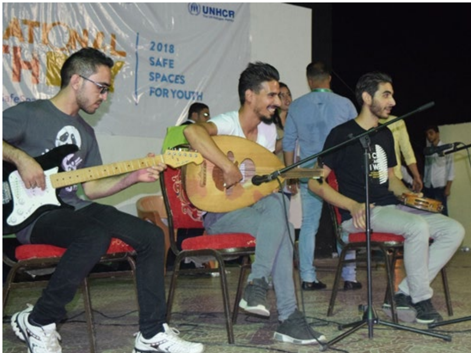
A youth band playing modern remixes of traditional songs at one of the 2018 International Youth Day events.