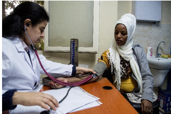
Egyptian doctor checks the blood pressure of an Eritrean refugee woman