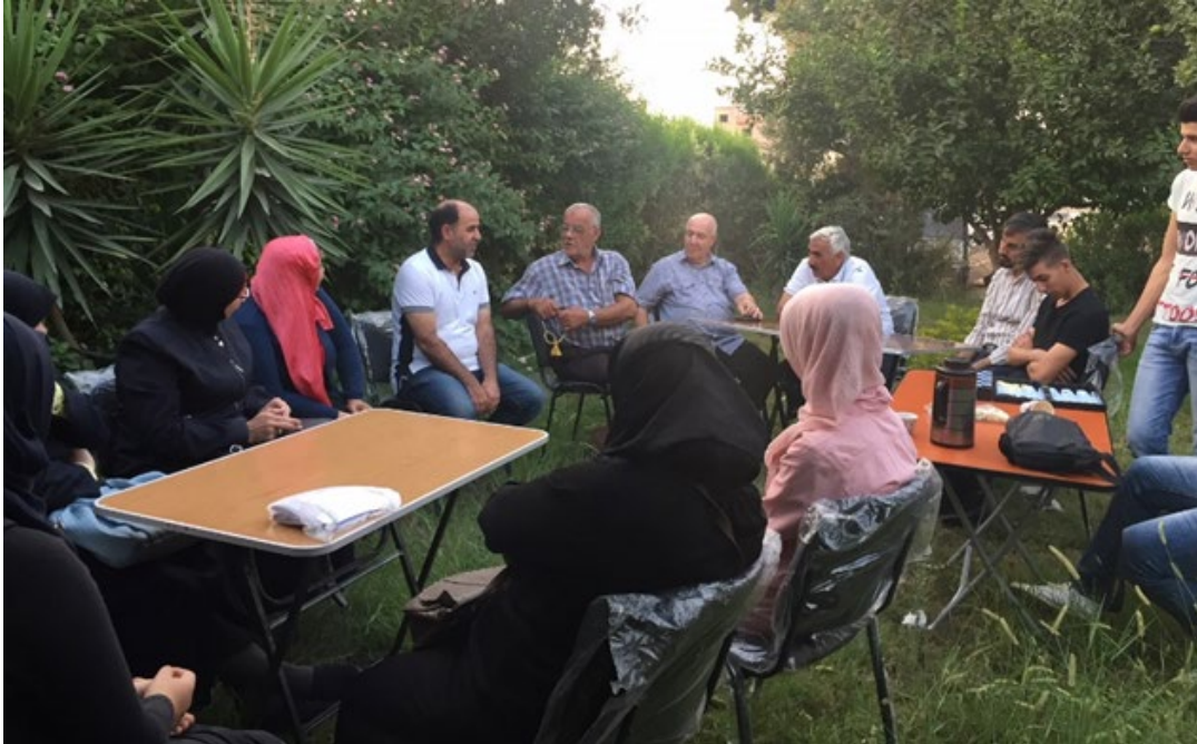
A refugee-initiated support group for older persons living in the distant outskirts of Greater Cairo.