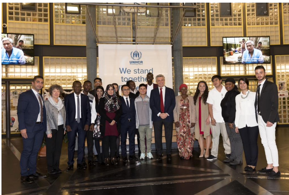
GYAC Delegate with the High Commissioner for Refugees Mr. Filippo Grandi at UNHCR HQ Geneva, December 2017.