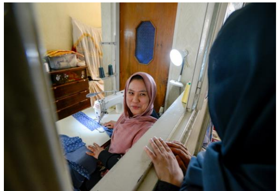
The Government of Iran and UNHCR assist Afghan refugee entrepreneurs with business start-ups.