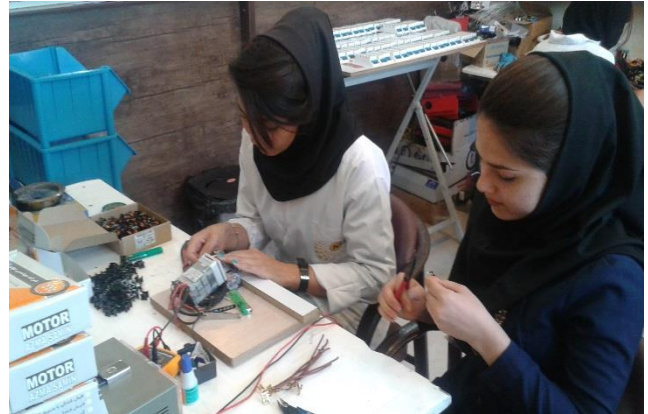
Through technical and vocational training courses young Afghan refugees in Iran develop in-demand, marketable skills.