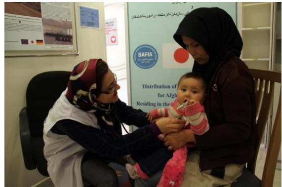
Refugees benefiting from UPHI coverage have better access to health services./ UNHCR Iran.