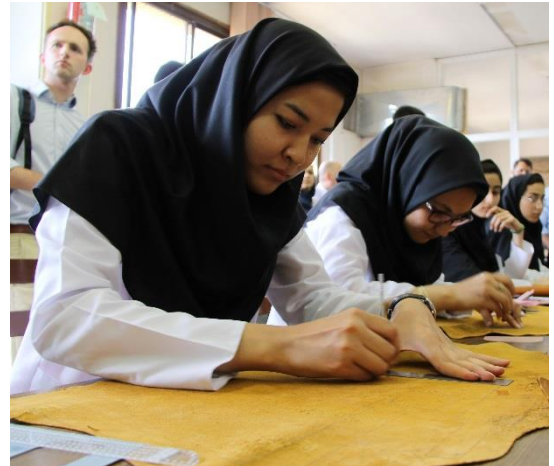
Through technical and vocational training courses young Afghan refugees in Iran develop in-demand, marketable skills.