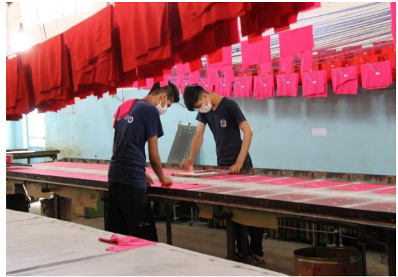
The Government of Iran and UNHCR assist Afghan refugees/ entrepreneurs with business start-ups.