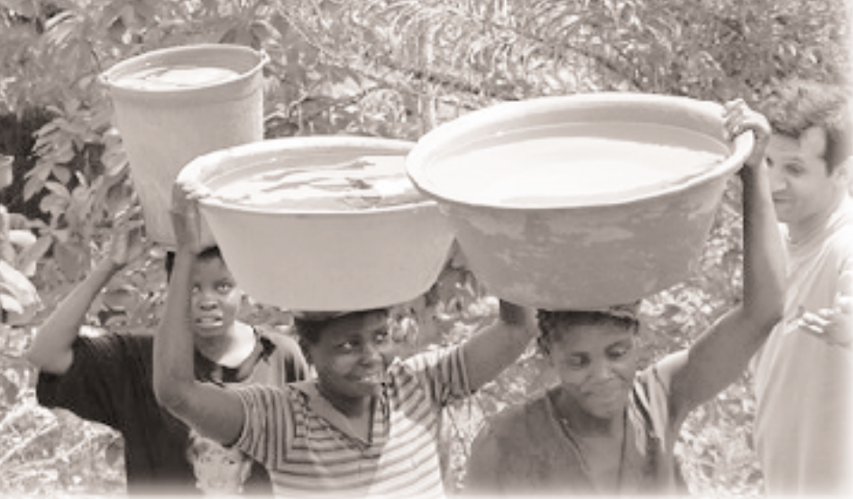
Angola: Project to address the need to have access to clean drinking water – IDP women in Uige.

In Angola , UNHCR will continue to provide international protection and basic humanitarian assistance to approximately 12,000 refugees and asylum-seekers, the majority of whom have come from the DRC. Most of the refugees have been in the country for more than 20 years. Many rural refugees who had achieved a degree of local integration have once again been displaced by the ongoing conflict. As these refugees are in an emergency-like situation, UNHCR will continue providing basic assistance, which will include food as well as support for primary education and income-generating activities. It is also envisaged that some 3,000 refugees will be assisted with transportation to return to their country of origin.