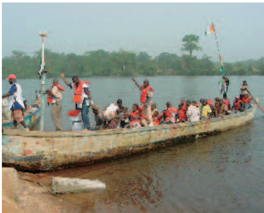
After years in exile, Liberian refugees voluntarily repatriated, with UNHCR's assistance, to their home country.

Prior to the outbreak of hostilities, the Government had embarked on an initiative to rehabilitate refugee-hosting areas, with technical and