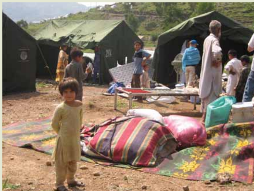
Facing threats of landslides, families in this village near Muzaffarabad prepare to be relocated to a camp nearby.

By the end of 2006, there were still some 35,000 displaced people who were unable to return home and thus