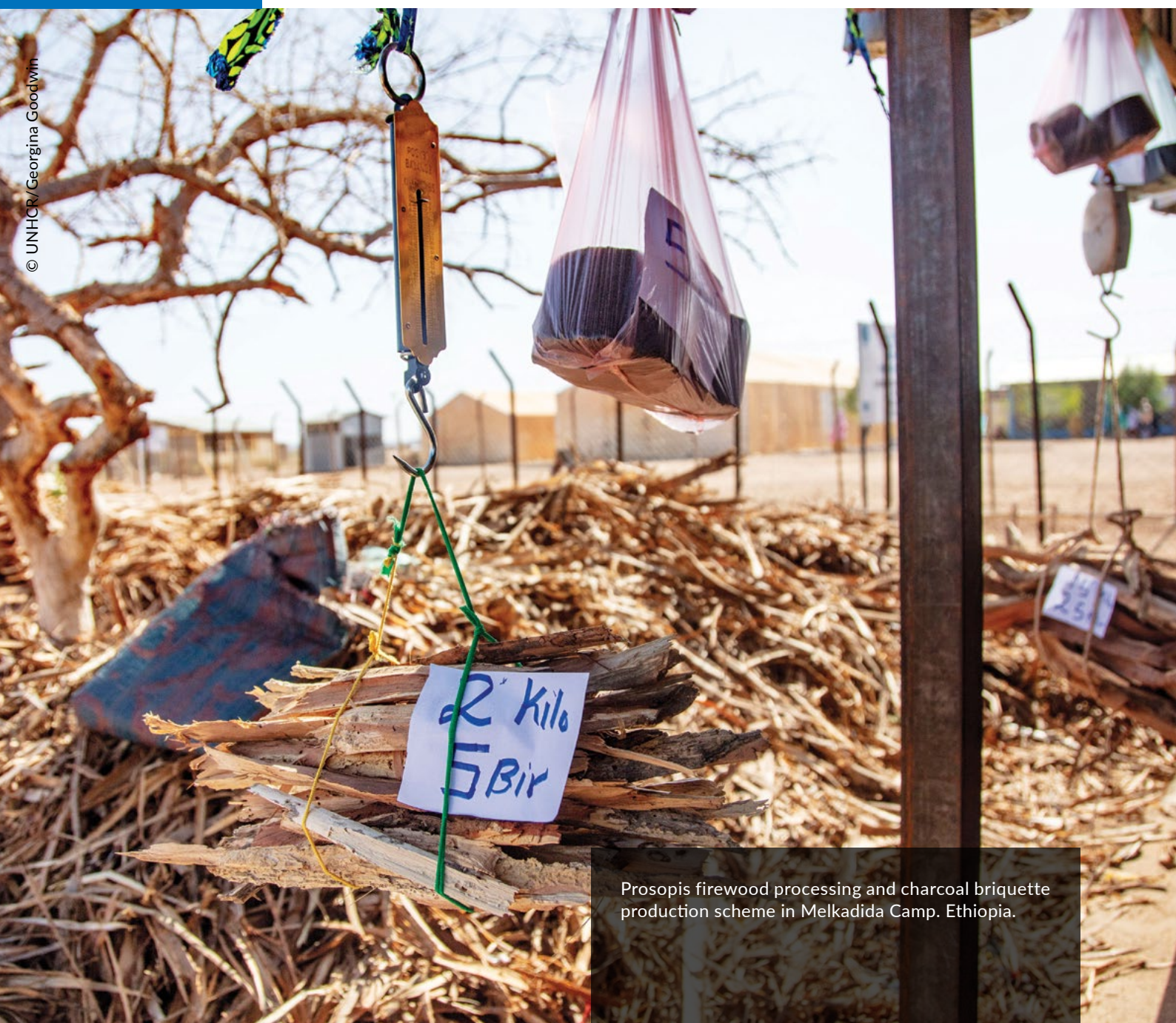
Prosopis firewood processing and charcoal briquette production scheme in Melkadida Camp, Ethiopia.

Understanding the energy needs of refugees, host communities and other stakeholders in displacement settings is a key requirement for the delivery of appropriate, clean and sustainable energy solutions. To meet this need, UNHCR is partnering with the International Renewable Energy Agency (IRENA), to gather reliable energy data and identify technically and financially sound renewable energy and energy efficiency options. In August 2019 UNHCR and IRENA worked together in Ethiopia to assess the current, and possible future, energy needs in refugee settlements. To ensure that the perspectives of refugees and host communities were considered, interviews were conducted with stakeholders at community and household levels to understand their needs for lighting, cooking and phone charging. Energy assessments were also conducted at humanitarian compounds and at service centres such as schools and health clinics. This information is now being used by UNHCR and partners to design and deliver quality energy solutions. UNHCR and IRENA will conduct further quality energy assessments in Iraq and beyond as part of a strong on-going collaboration.