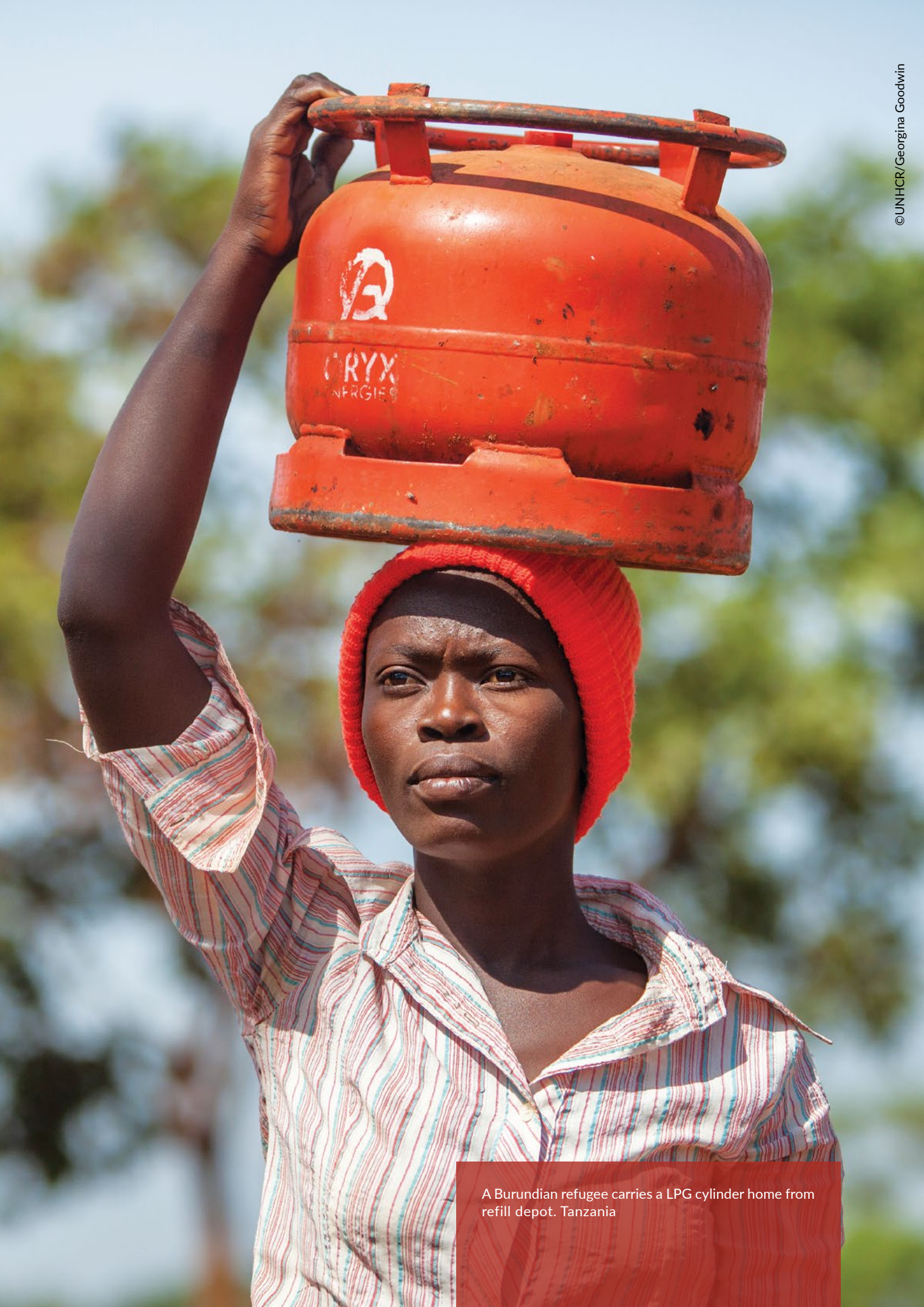
A Burundian refugee carries a LPG cylinder home from refill depot, Tanzania