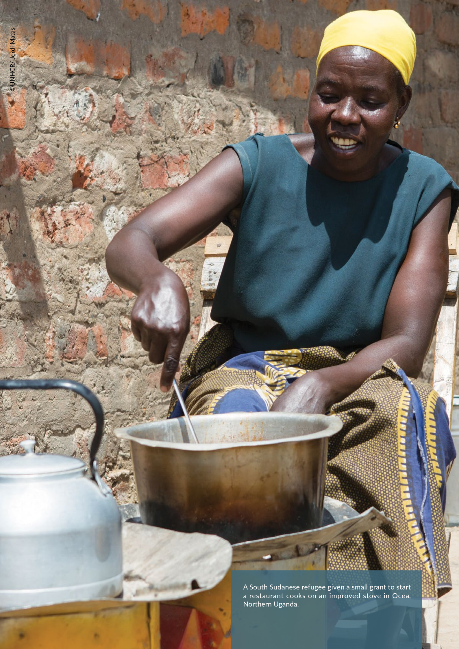
A South Sudanese refugee given a small grant to start a restaurant cooks on an improved stove in Ocea, Northern Uganda.