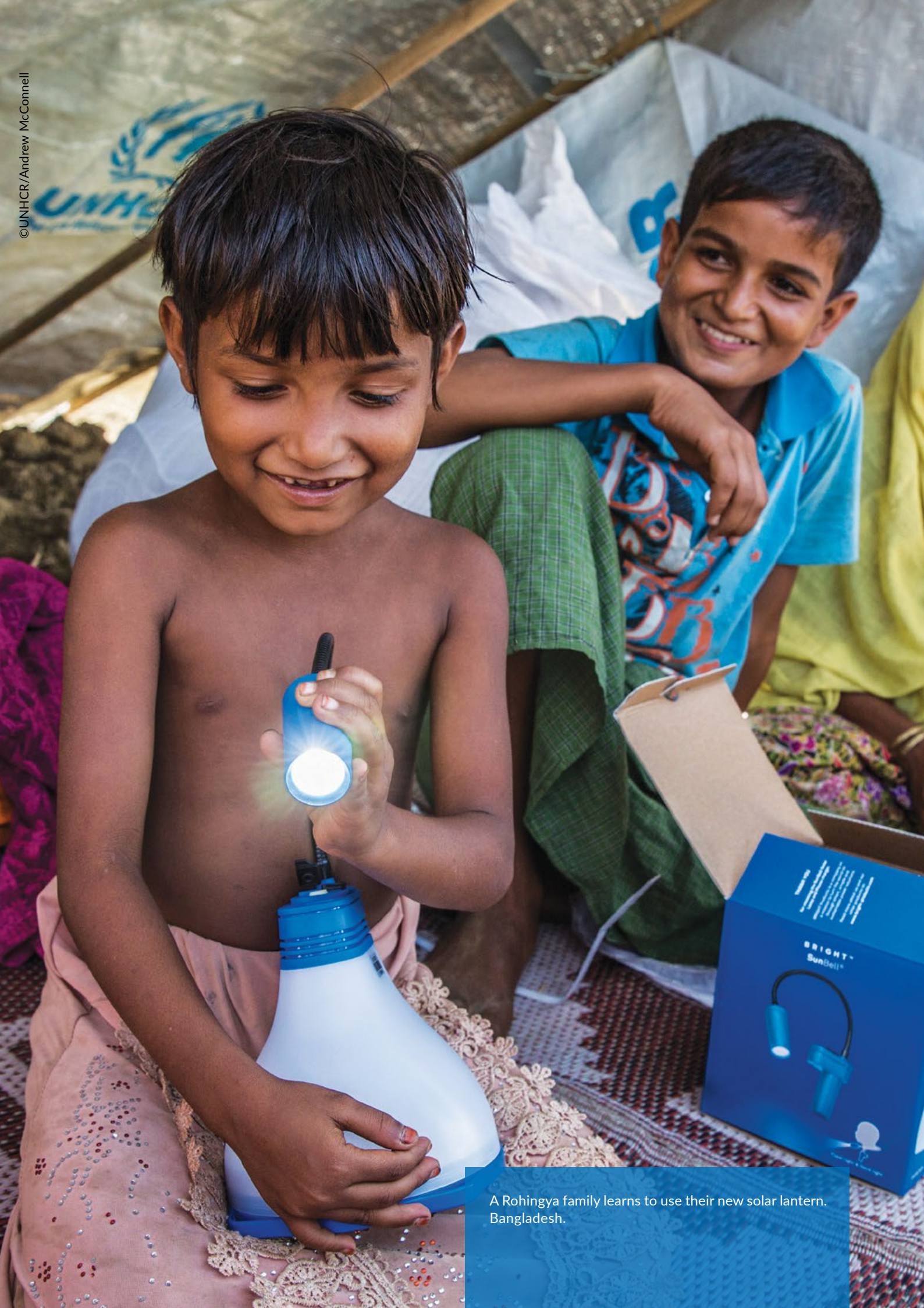
A Rohingya family learns to use their new solar lantern. Bangladesh.