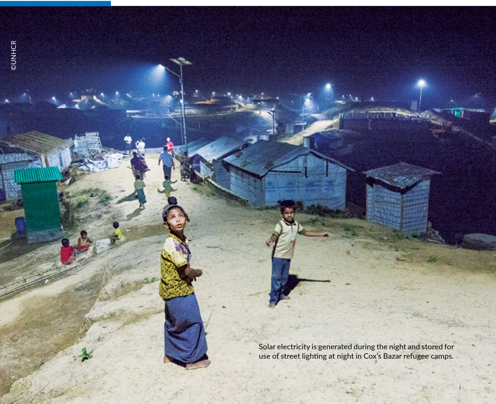
Solar electricity is generated during the night and stored for use of street lighting at night in Cox's Bazar refugee camps.