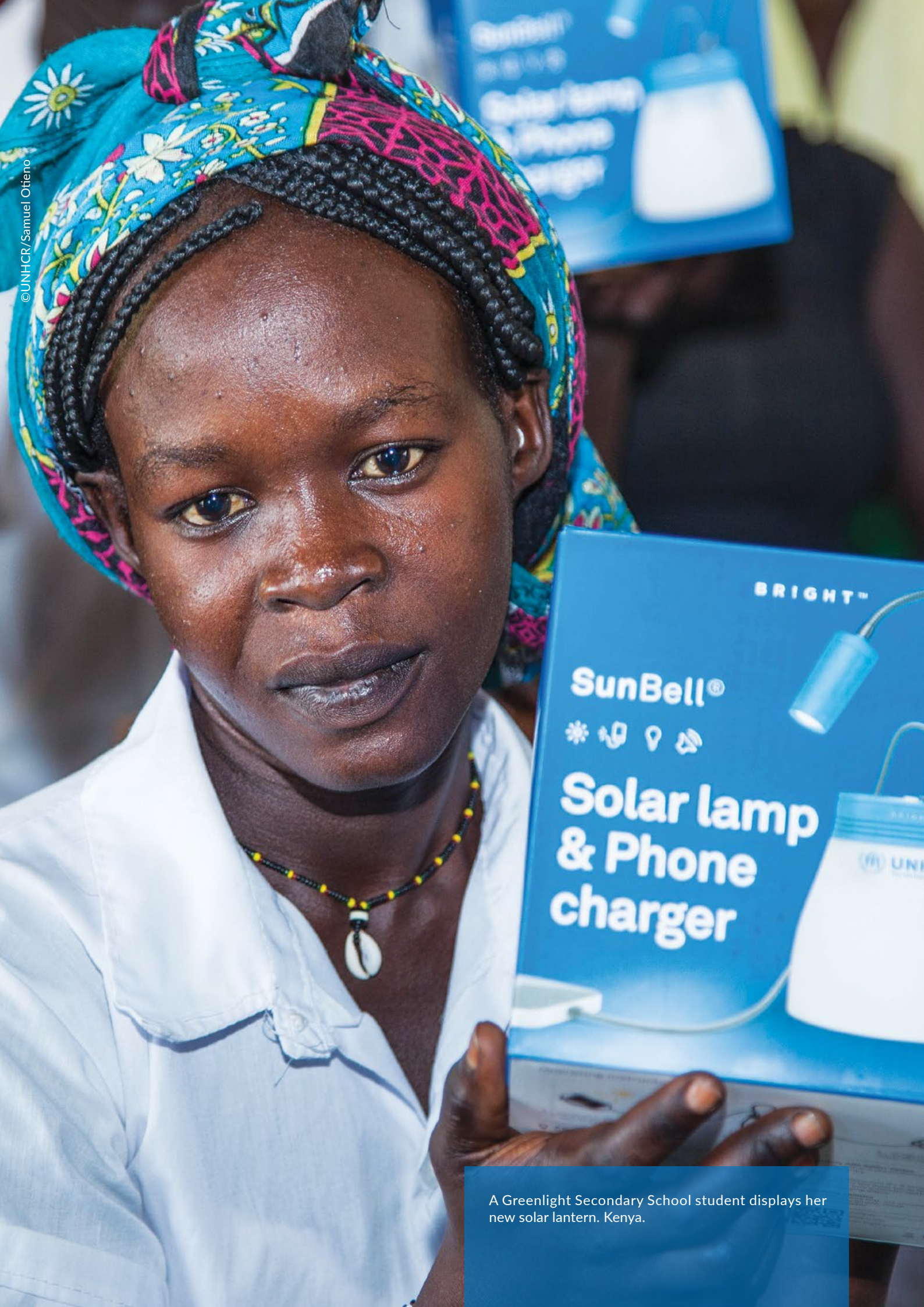
A Greenlight Secondary School student displays her new solar lantern. Kenya.