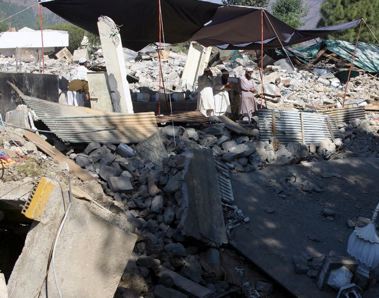
Pakistan / Earthquake damage / 3. Stunned survivors who have lost everything survey the destruction, Balakot, North West Frontier Province.