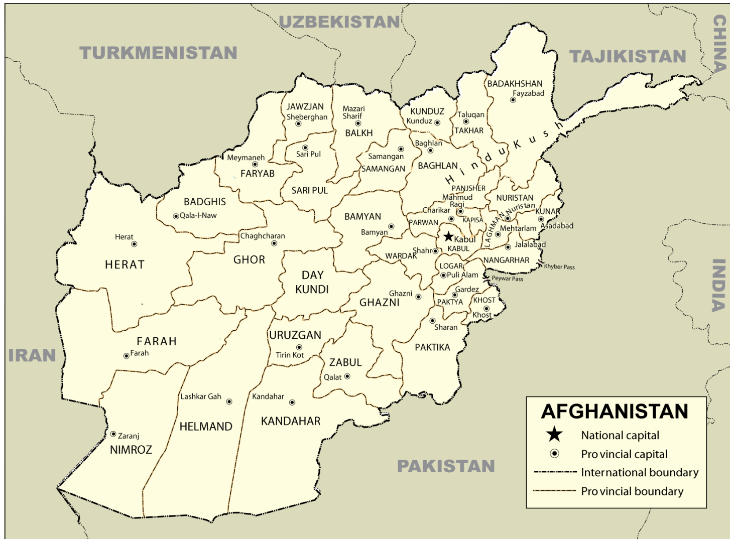
Figure A-1. Map of Afghanistan