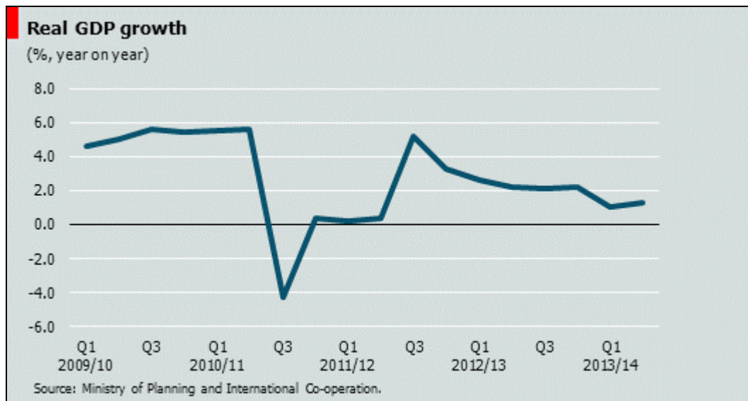
Figure 3. Egypt's Real GDP Growth

Egypt's economy is barely growing; economists project perhaps 2% growth for the current Egyptian fiscal year, an amount that just exceeds the country's annual population growth rate. 34 For Egypt, the good news is that the economy is no longer contracting, as some foreign direct investment has returned, and foreign currency reserves are no longer dwindling, stabilizing at $17.4 billion as of April 2014. They had been at $36 billion before unrest began in 2011.