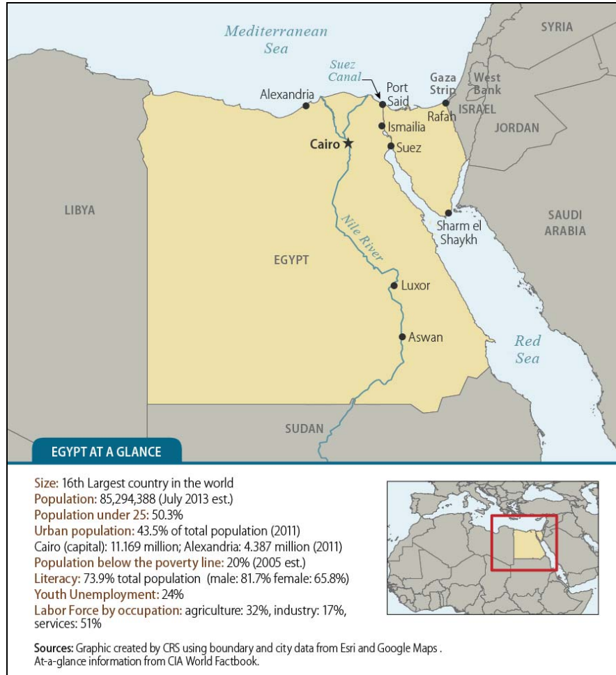
Figure I. Egypt at a Glance

Ultimately, Egypt and the Arab Gulf monarchies want the Administration and Congress not only to continue foreign assistance to Egypt without additional conditions, but also to do more financially for a country that has structural economic deficiencies, such as high annual budget deficits, energy shortages, and high youth unemployment. Other Arab countries, such as Tunisia and Jordan (with Yemen possibly soon to follow), have received International Monetary Fund (IMF) lending packages in recent years, and Egypt may seek one as well. The Arab Gulf monarchies want Egypt to return to the good graces of Western governments so that the larger international community can support Egypt's struggling economy. 11 To date, Saudi Arabia, Kuwait, and the United Arab Emirates have pledged over $18 billion in direct loans, fuel subsidies, and grants to the Egyptian government, with billions more being invested from the private sector in residential housing and commercial real estate. 12 Some reports suggest that these same countries may be preparing to assist Egypt with an