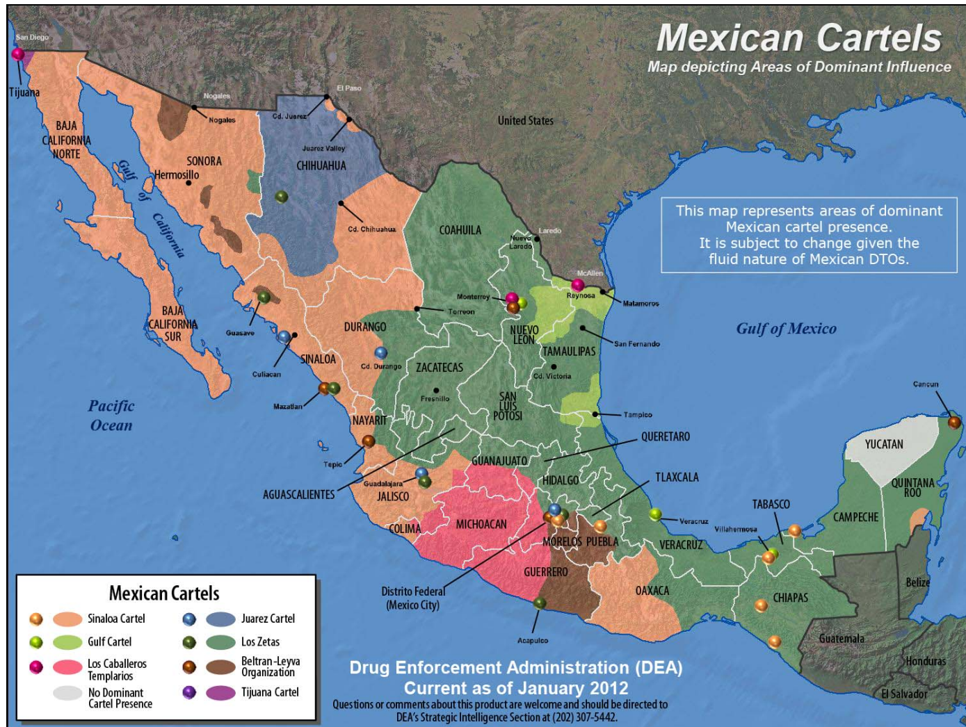
Figure 1. Map of DTO Areas of Dominant Influence in Mexico by DEA