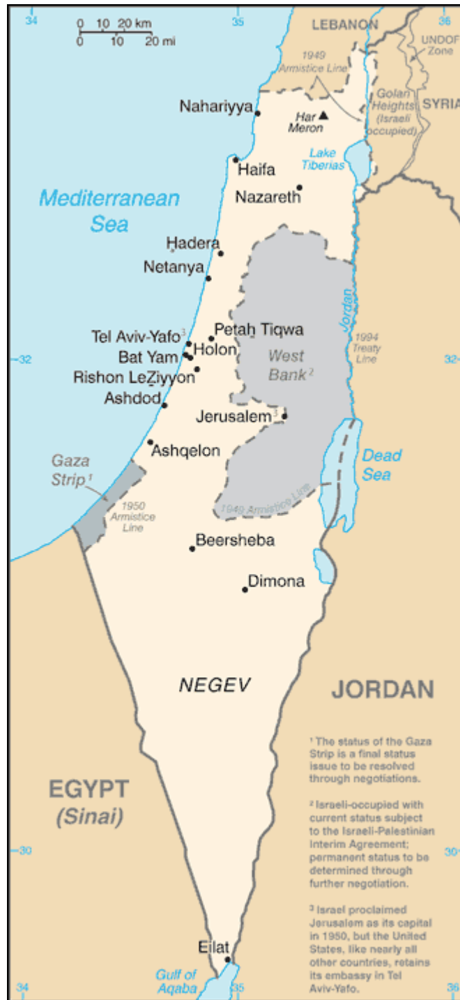
Figure I. Map of Israel